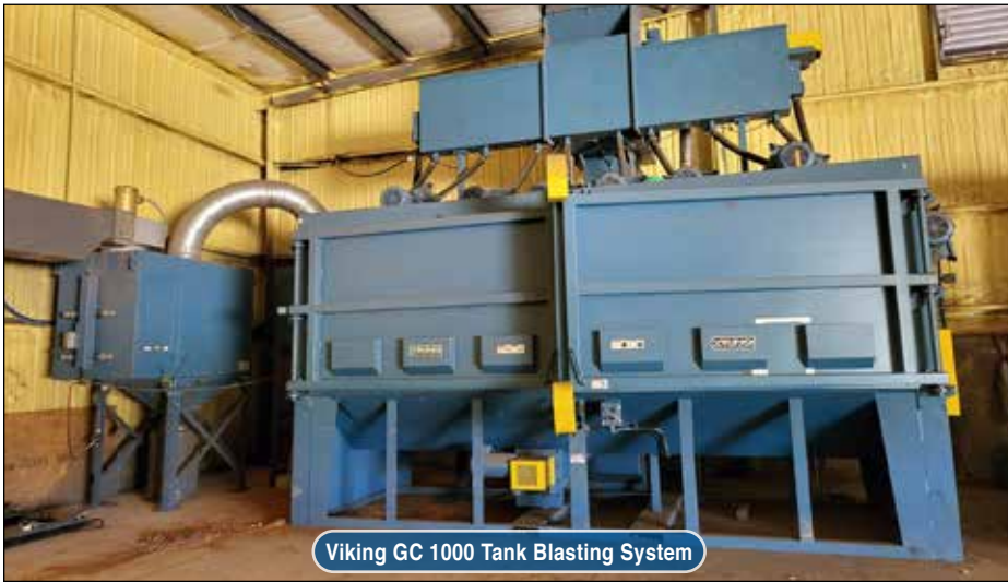
Viking GC 1000 Tank Blasting System