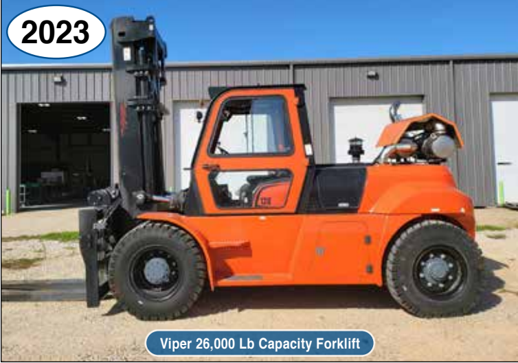
Viper 26,000 Lb Capacity Forklift