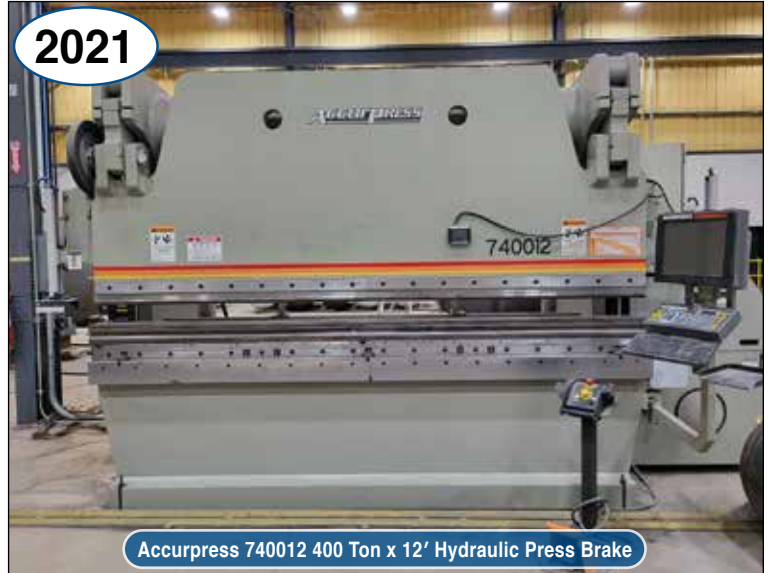
Accurpress 740012 400 Ton x 12' Hydraulic Press Brake