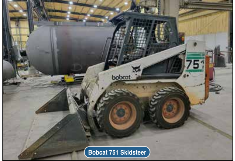
Bobcat 751 Skidsteer