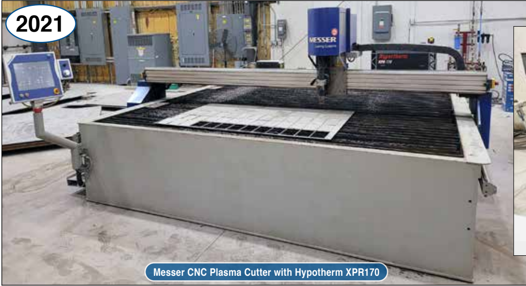
Messer CNC Plasma Cutter with Hypotherm XPR170