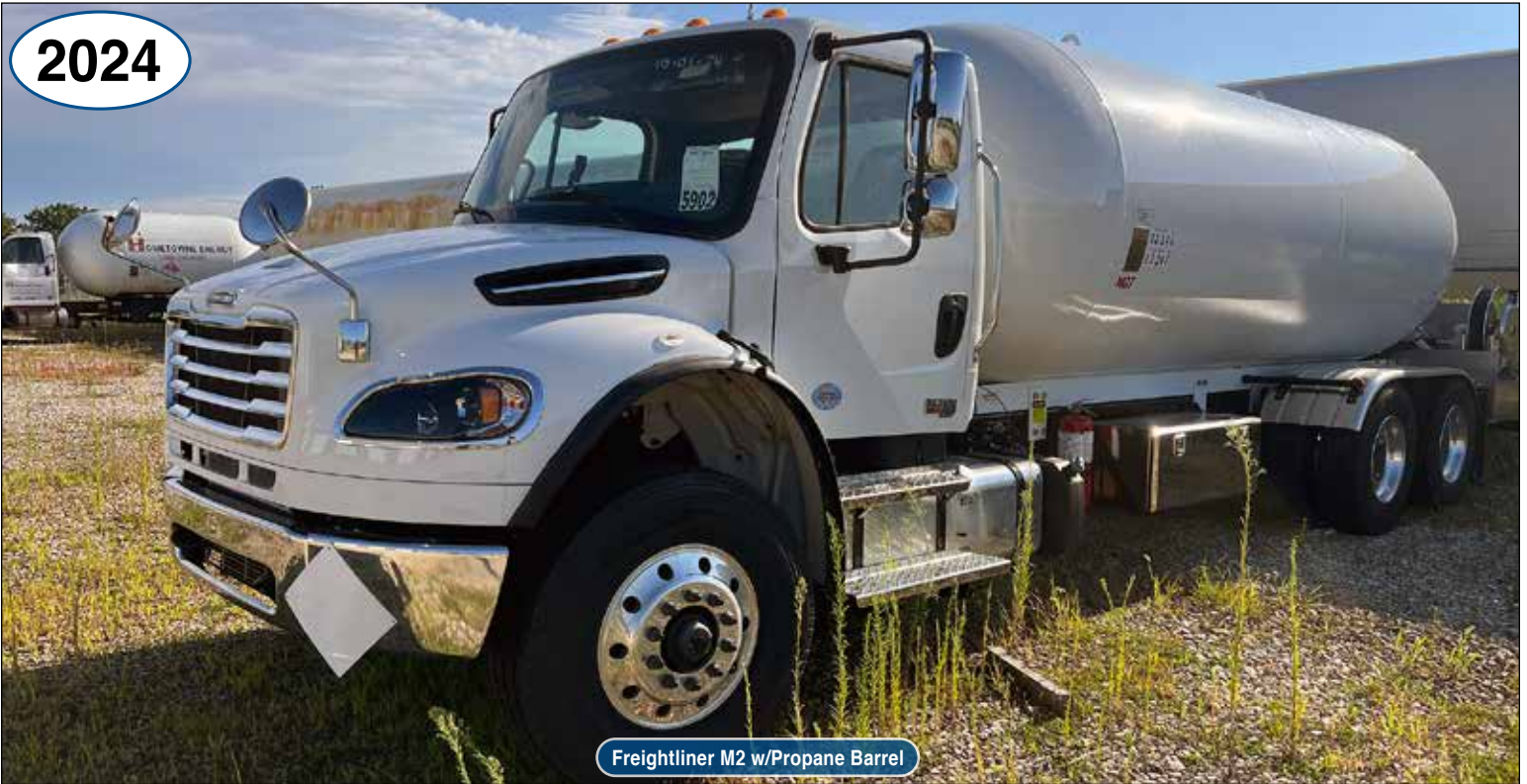
Freightliner M2 w/Propane Barrel