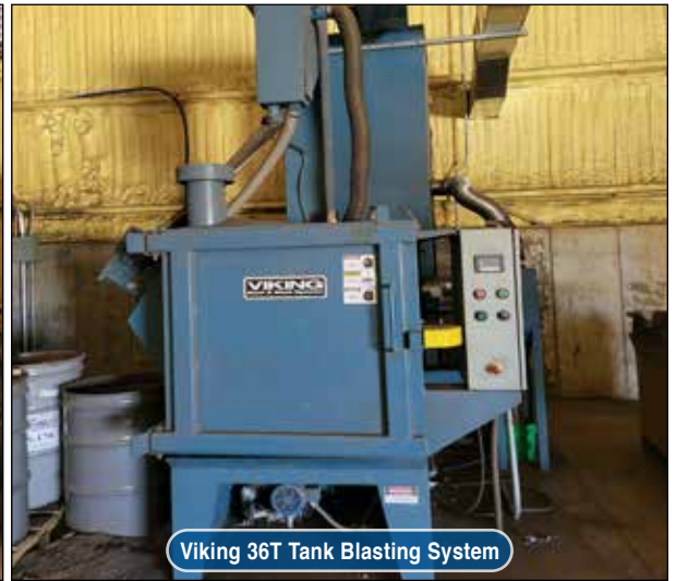
Viking 36T Tank Blasting System