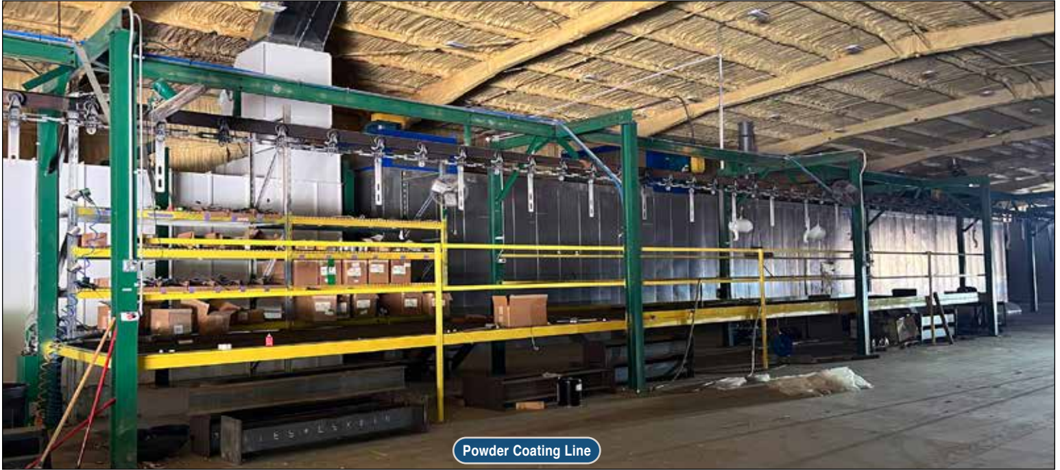
Powder Coating Line