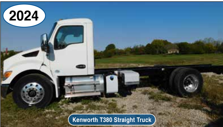
Kenworth T380 Straight Truck