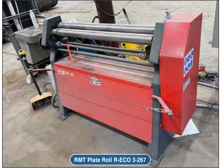
RMT Plate Roll R-ECO 3-267