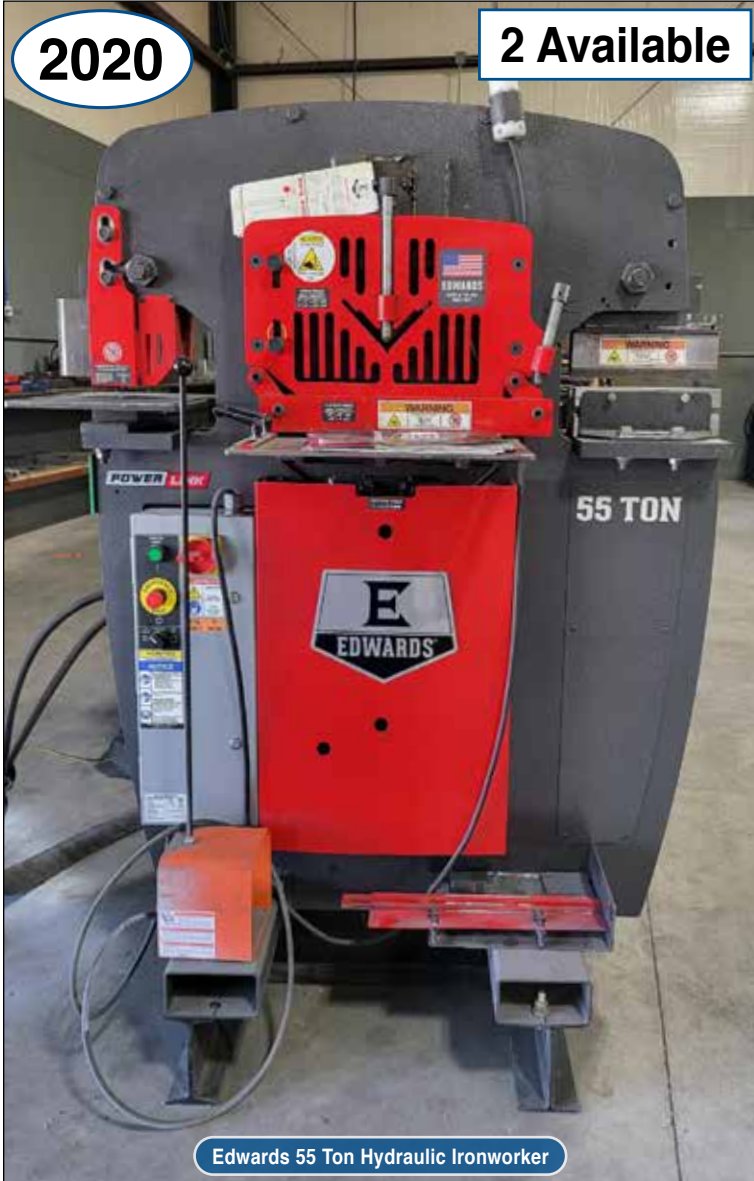
Edwards 55 Ton Hydraulic Ironworker