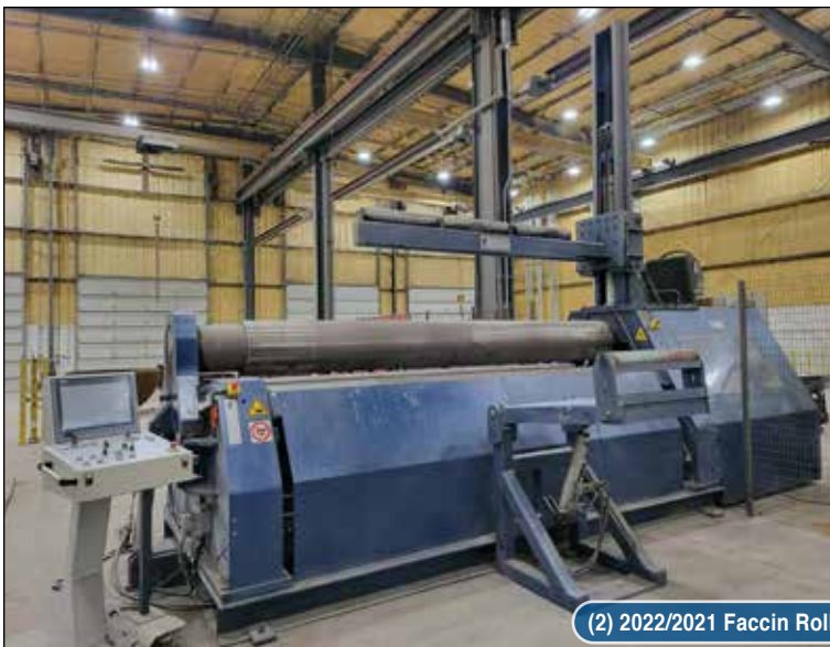
(2) 2022/2021 Faccin Roll Forming Bending Machines