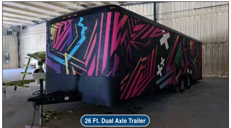
26 Ft. Dual Axle Trailer