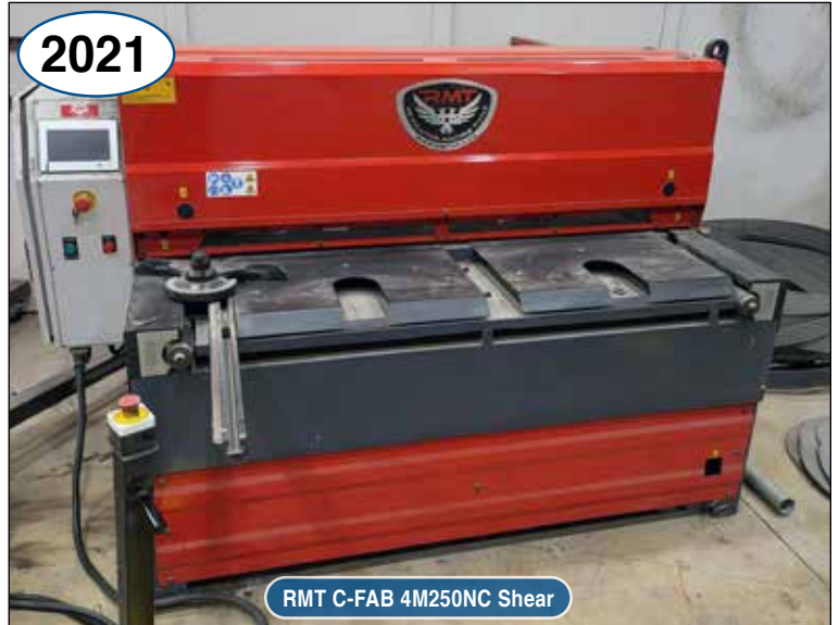
RMT C-FAB 4M250NC Shear