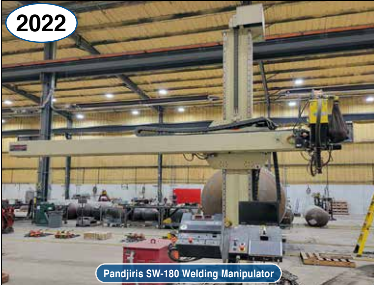
Pandjiris SW-180 Welding Manipulator