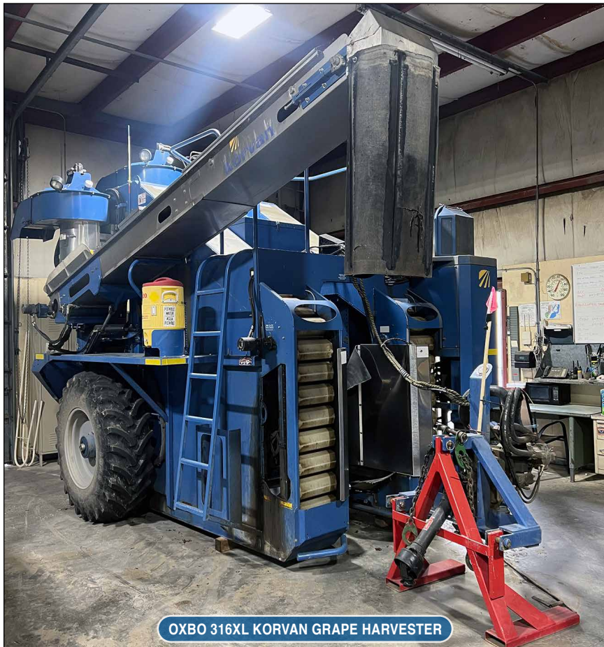
OXBO 316XL KORVAN GRAPE HARVESTER

INSPECTION: Wednesday, May 29, 8am to 5pm PT ASSET LOCATION: 531 Levey Road, Pasco, WA 99301