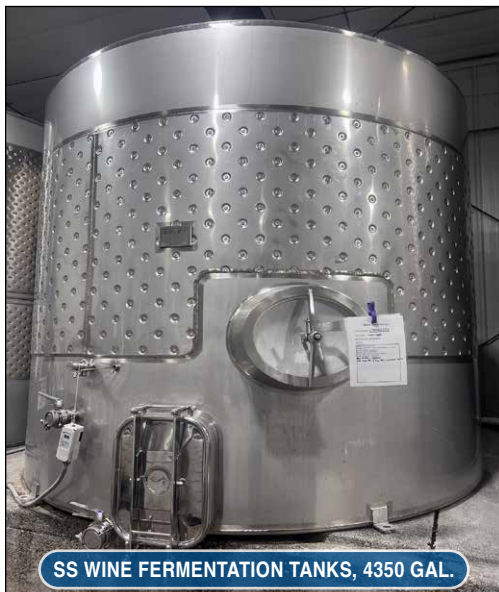
SS WINE FERMENTATION TANKS, 4350 GAL.