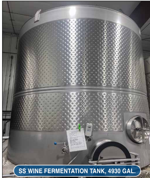
SS WINE FERMENTATION TANK, 4930 GAL.