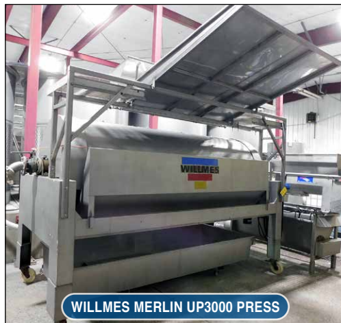
WILLMES MERLIN UP3000 PRESS