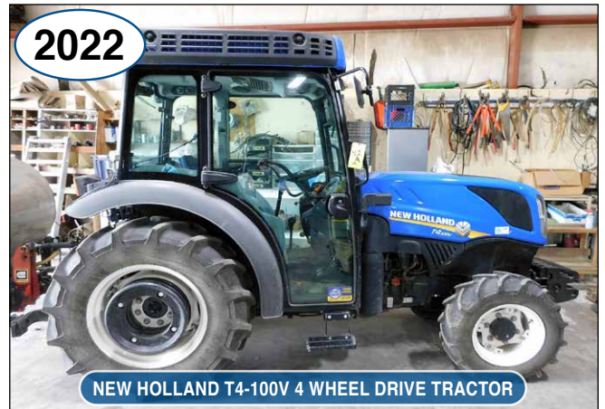
2022 NEW HOLLAND T4-100V 4 WHEEL DRIVE TRACTOR