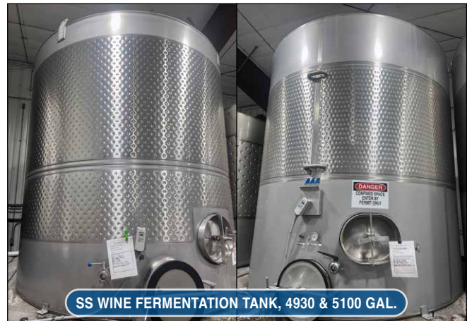
SS WINE FERMENTATION TANK, 4930 & 5100 GAL.

For information, contact us at 224.927.5320 or sales@pplauctions.com