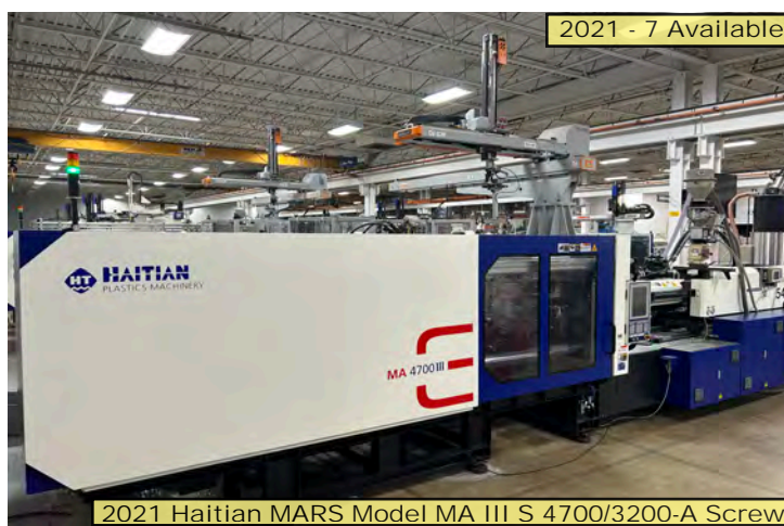
2021 Haitian MARS Model MA III S 4700/3200-A Screw