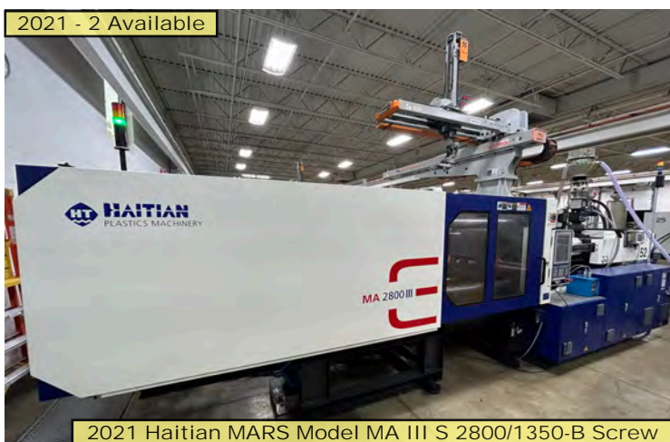
2021 Haitian MARS Model MA III S 2800/1350-B Screw