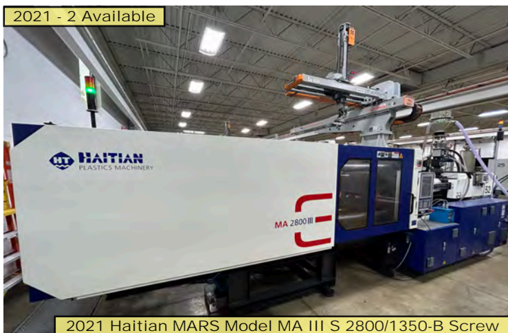
2021 Haitian MARS Model MA III S 2800/1350-B Screw