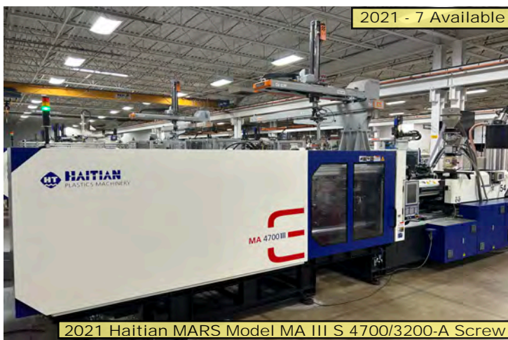
2021 Haitian MARS Model MA III S 4700/3200-A Screw