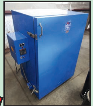
KEEN MDL. H-1000MT ROD OVEN