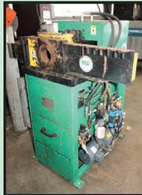
MSI C5H CHAMFERING MACHINE