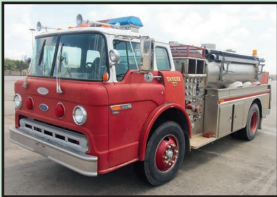
FORD MDL. 8000 FIRE TRUCK

WEDNESDAY, JUNE 14 10:00 A.M. LIVE ONLINE WEBCAST (NO ONSITE BIDDING)