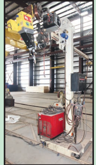
PANDJIRIS 8' X 8' MANIPULATOR

WEDNESDAY, JUNE 14 10:00 A.M. LIVE ONLINE WEBCAST (NO ONSITE BIDDING)