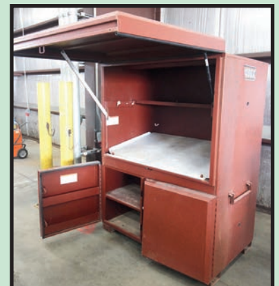
(1 OF 3) JOBOX TOOL BOXES