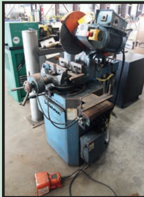
SCOTCHMAN CUT-OFF SAW