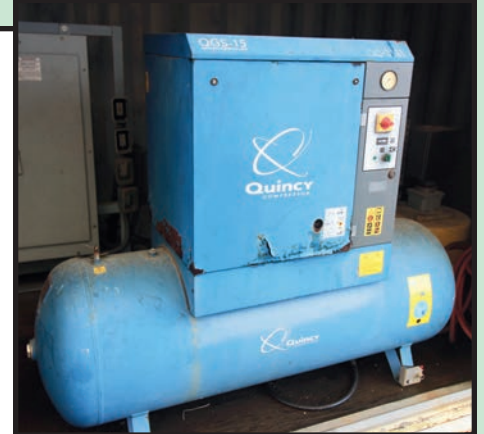
QUINCY 15 HP ROTARY SCREW AIR COMPRESSOR

(2) INGERSOLL RAND R55i 55 HP ROTARY SCREW AIR COMPRESSORS, w/dryer; QUINCY QGS-15 ROTARY SCREW AIR COMPRESSOR, 15 HP, 18,005 H.O.M.; SULLAIR 185 PORTABLE AIR COMPRESSOR, 3,070 H.O.M.