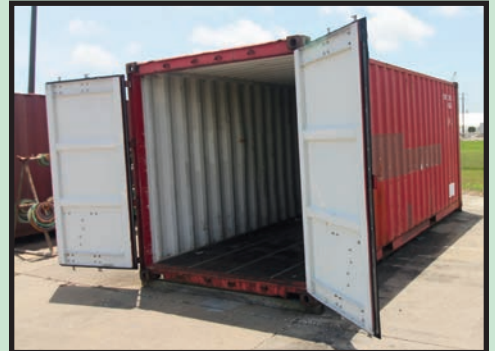
(1 OF 2) 20' CONEX BOXES