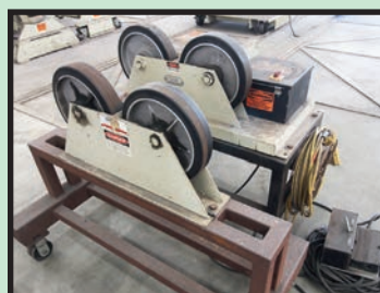
PANDJIRIS MISSOURI MULE 15 T. TURNING ROLL SETS