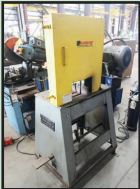
KALAMAZOO CUT-OFF SAW