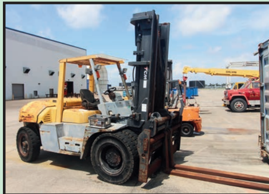
TCM 22,000-LB. BASE CAP. DIESEL FORKLIFT