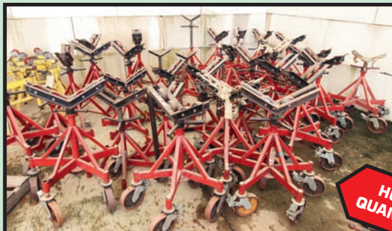
SAMPLE VIEW OF PORTABLE V JACKS

(12) H.D. DOUBLE SIDED CANTILEVER RACK, 5,500-lb. max. per arm; (35) H.D. SET UP FABRICATION TBLs.; H.D. PIPE RACKS; MODULAR CANTILEVER RACK SYSTEM; DUNNAGE; CONCRETE PARKING LOT STOPS.