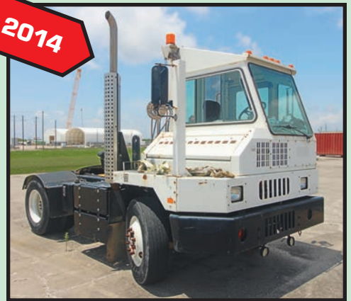
KALMAR SPOTTING TRUCK