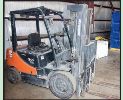
DOOSAN 6,000-LB. CAP. FORKLIFT