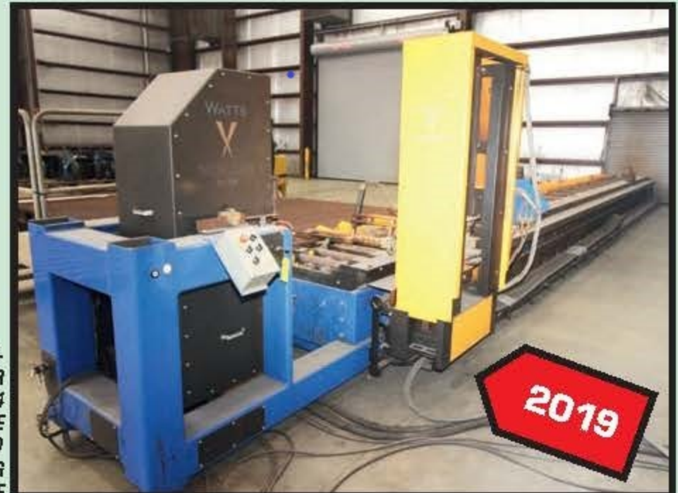
WATTS- MUELLER MDL W-364 CNC PIPE CUTTING AND PROFILING MACHINE