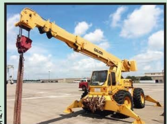
GALION 15 T. HYD. ROUGH TERRAIN CRANE

FOR ONLINE BIDDING AT THIS AUCTION. Go to www.pmi-auction.com and click on BidSpotter or proxibid on our calendar page for this auction sale.