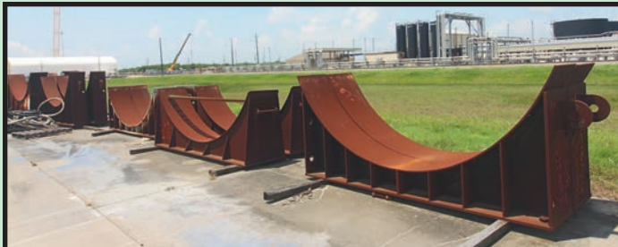
SAMPLE VIEW OF TANK CRADLES