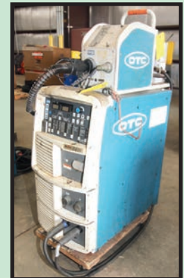
OTC P400 WELDER W/FEEDER