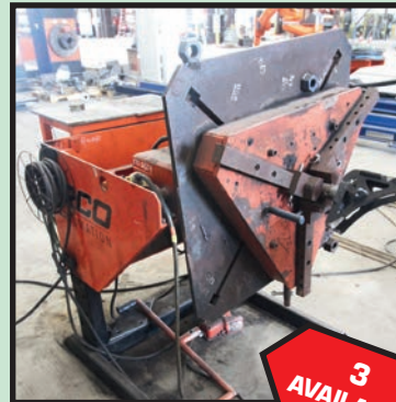
IRCO AUTOMATION 3,000-LB. CAP. POSITIONER