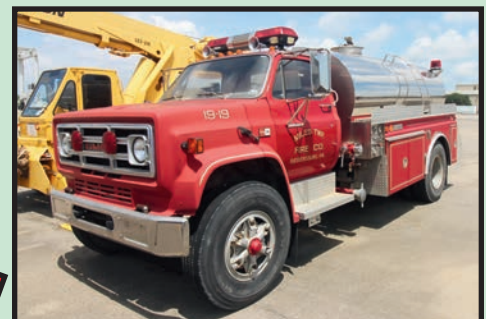
GMC MDL. 7000 FIRE TRUCK

WED., JUNE 14 • 10:00 A.M. LIVE ONLINE WEBCAST (NO ONSITE BIDDING)