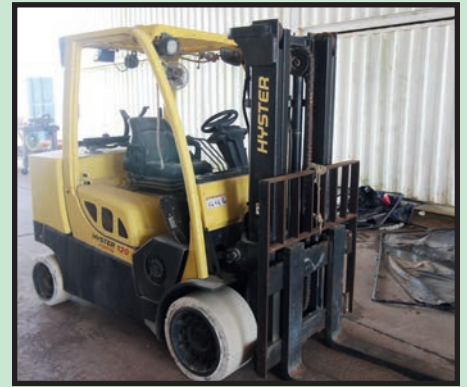
HYSTER FORTIS 11,950-LB. BASE CAP. LPG FORKLIFT