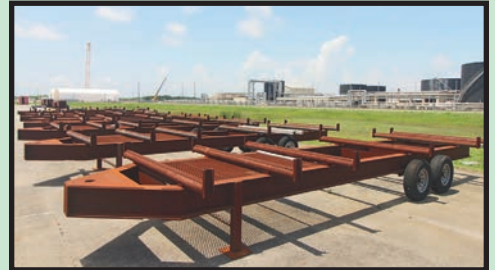
(9) 30' CUSTOM TRAILERS