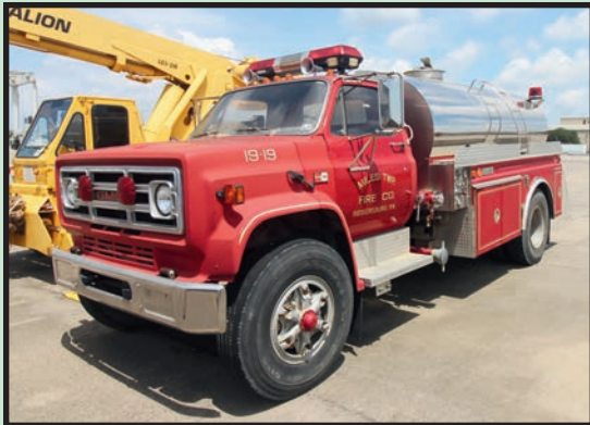
GMC MDL. 7000 FIRE TRUCK