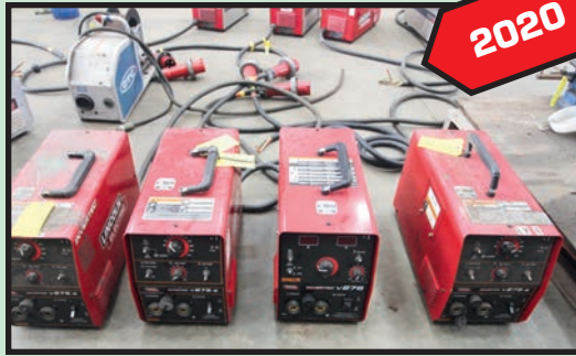
LINCOLN INVERTEC V276 WELDING MACHINES