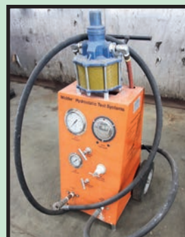
WIDDER HYDROSTATIC TEST SYSTEM