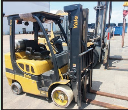
YALE 7,000-LB. BASE CAP. LPG FORKLIFT