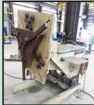
PANDJIRIS MDL. 60-12 6,000-LB. CAP. POSITIONER