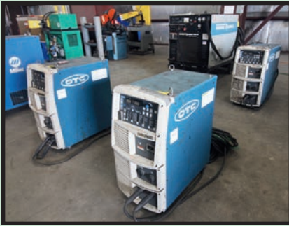
OTC WELBEE P400 WELDING MACHINE