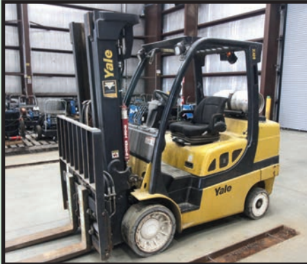
YALE 8,000-LB. BASE CAP. LPG FORKLIFT

DOOSAN 6,000-LB. BASE CAP. MDL. G30G , gasoline, 5,250-lb. cap. as equipped, 188" lift ht., 3-stage mast, side shift, S/N FGA0Y-1490-00413.