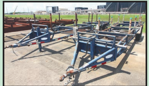
(2) 22' PIPE TRAILERS