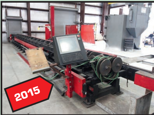
VERNON MDL. MPM-2-0348 CNC OXY PIPE PROFILER