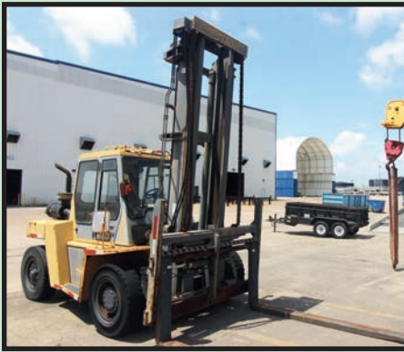
CATERPILLAR 20,000-LB. BASE CAP. DIESEL FORKLIFT