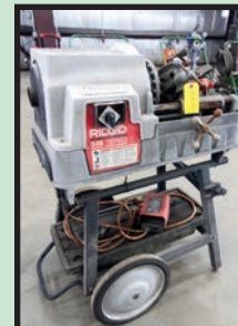
RIDGID 535 PIPE THREADER

8' x 8' PANDJIRIS SUB ARC , S/N 19971X03-2.