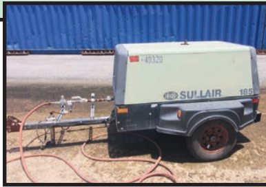
SULLAIR 185 PORTABLE AIR COMPRESSOR