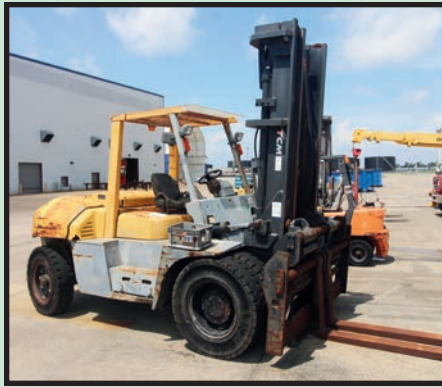
TCM 22,000-LB. BASE CAP. DIESEL FORKLIFT