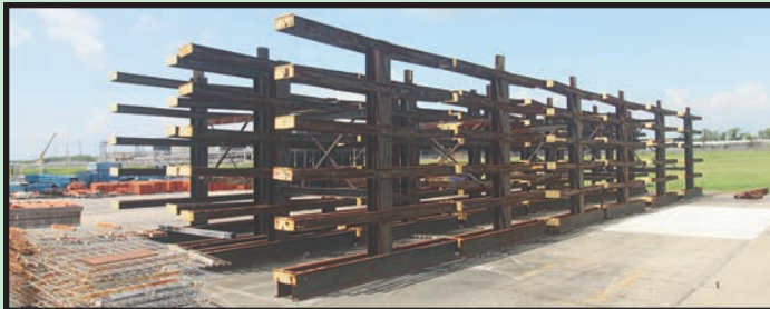
H.D. DOUBLE SIDED CANTILEVER RACKS