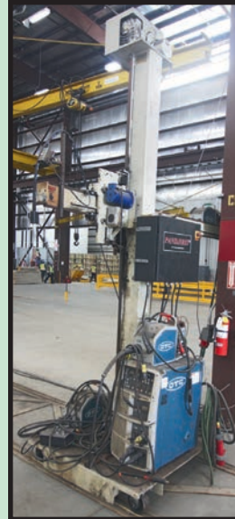
PANDJIRIS 8' X 8' MANIPULATOR