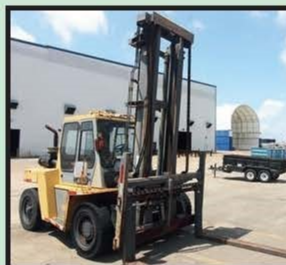
CATERPILLAR 20,000-LB. BASE CAP. DIESEL FORKLIFT