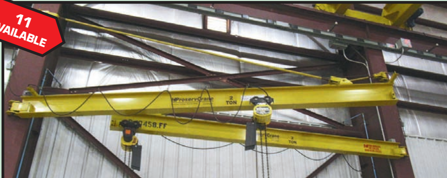
SAMPLE VIEW OF PROSERV 2 T. CAP. X 18' REACH WALL MOUNTED JIB CRANES