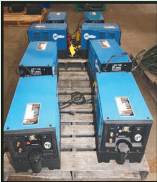
MILLER COOLMATE CHILLERS

KEEN MDL. H-1000MT; KEEN MDL. K-4RSD; (2) ARCSTAR MDL. EQ-250DDT3.