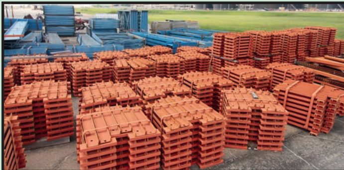
SAMPLE VIEW OF MODULAR CANTILEVER RACK SYSTEM