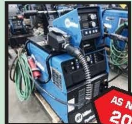
MILLER PIPEWORX 400 WELDING SYSTEM

3959 OSCAR NELSON JR. DRIVE, BAYTOWN, TEXAS 77523