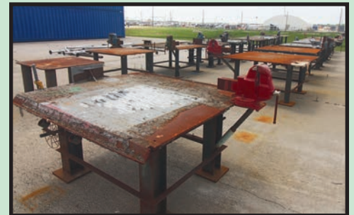
SAMPLE VIEW OF FABRICATION TABLES