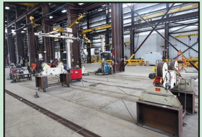
PANDJIRIS MANIPULATORS AND TURNING ROLL SETS

FOR BIDDING AT THIS AUCTION. Go to www.pmi-auction.com and click on BidSpotter or proxibid on our calendar page for this auction sale.