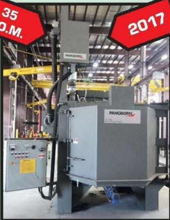
PANGBORN 6LK-9 BLAST CLEANING SYSTEM

Monday & Tuesday, June 12 & 13, 9:00 A.M. to 4:00 P.M.