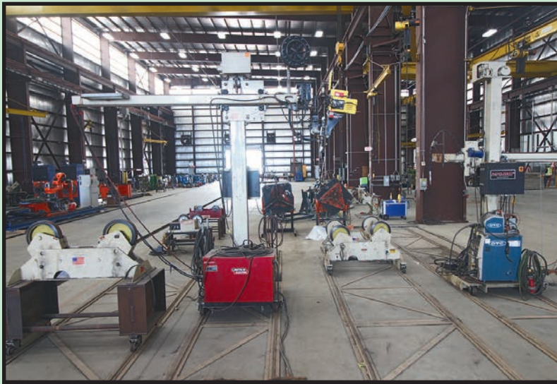
PANDJIRIS MANIPULATORS AND TURNING ROLL SETS