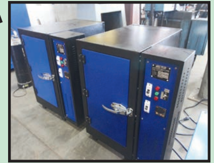
ARCSTAR ROD OVENS