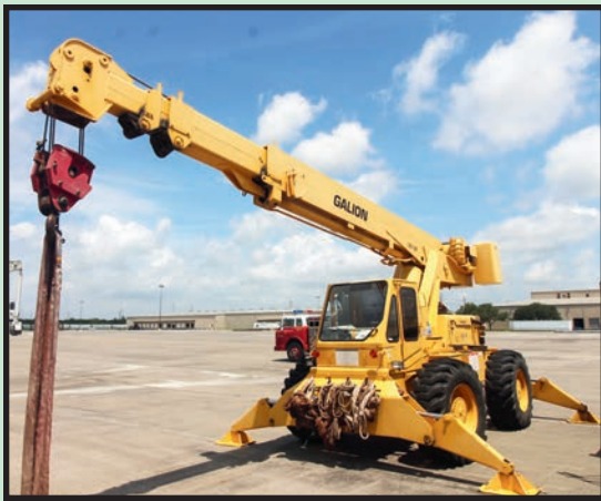
GALION 15 T. HYD. ROUGH TERRAIN CRANE