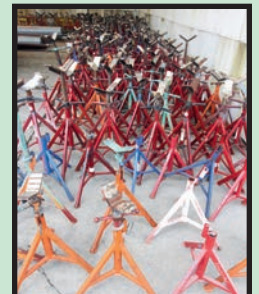
SAMPLE VIEW OF JACK STANDS