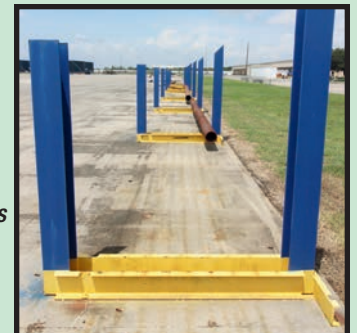
H.D. PIPE RACKS