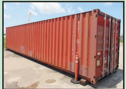
40' CONEX BOX

FOR ONLINE BIDDING AT THIS AUCTION. Go to www.pmi-auction.com and click on BidSpotter or proxibid on our calendar page for this auction sale.