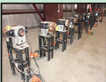
SAMPLE VIEW OF PANDJIRIS AND PROFAX MINI POSITIONERS

(2) PANDJIRIS MISSOURI MULE MM-15 TURNING ROLL SETS, 15 T. cap., w/rails, S/N 19723x01-1; PROFAX TR 5000, 5,000-lb. cap., w/rails, S/N 3126; PANDJIRIS PIPER 3, 4,000-lb. cap.; KEY PLANT MDL. PR3, 3,000-lb. cap., S/N 10616.