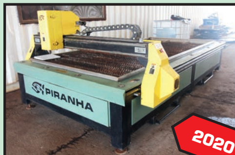
PIRANHA MDL. C510 5' x 10' CAP. CNC PLASMA TABLE