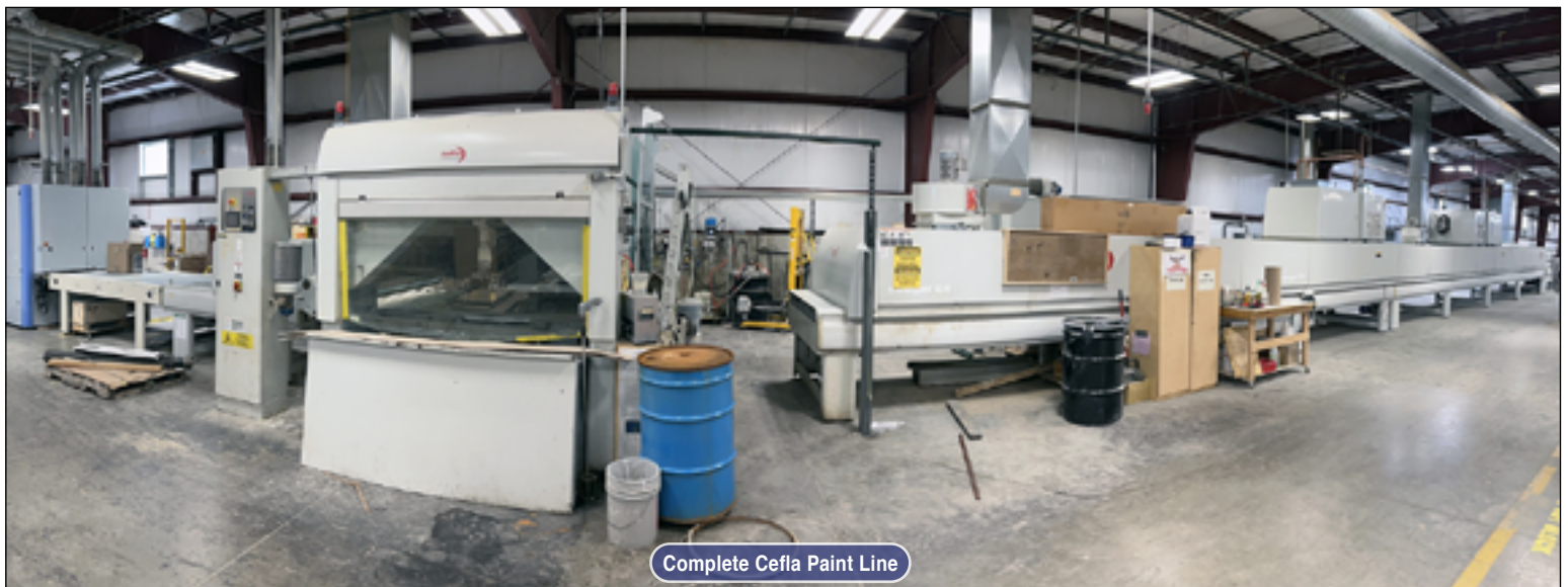
Complete Cefla Paint Line

ASSET LOCATION: 701 W. Mill Street, Angola, IN 46703