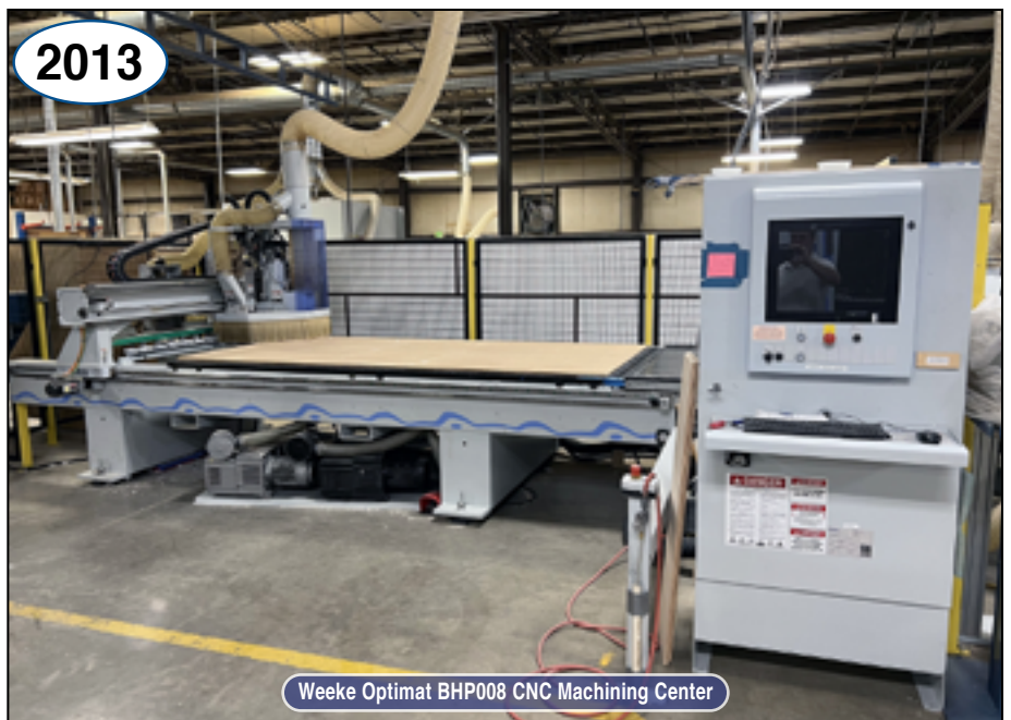
Weeke Optimat BHP008 CNC Machining Center