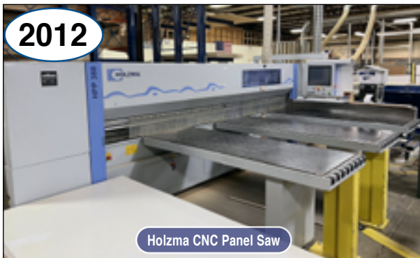
Holzma CNC Panel Saw

2015 HOLZER EVOLUTION 7405 CNC PROCESSING CENTER 2015 WEEKE OPTIMAT BHP008 CNC MACHINING CENTER 2013 WEEKE OPTIMAT BHP008 CNC MACHINING CENTER WITH VACUUM LIFT 2012 HOLZMA PANEL SAW WITH PRESSURE BEAM 2012 WEEKE OPTIMAT ABD050 CNC DRILL AND DOWEL MACHINE (2) WEEKE VENTURE 2.5M CNC MACHINING CENTERS (2) WEEKE OPTIMAT ABD150 CNC DRILL, DOWEL AND INSERTION MACHINES OMEGA FP3000 CNC SAW