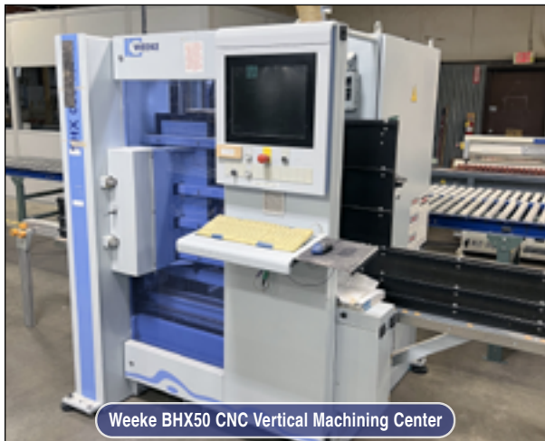
Weeke BHX50 CNC Vertical Machining Center