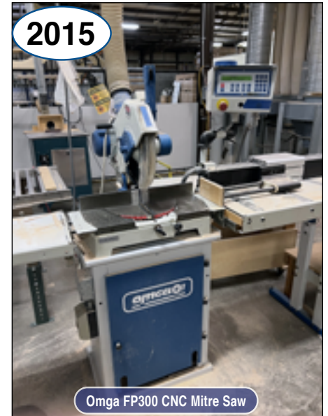
Omga FP300 CNC Mitre Saw