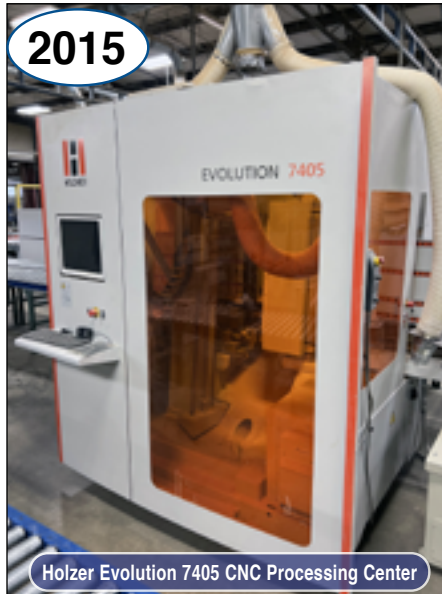
Holzer Evolution 7405 CNC Processing Center