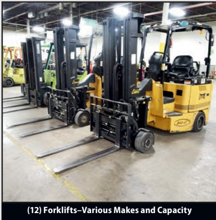
(12) Forklifts-Variou Makes and Capacity