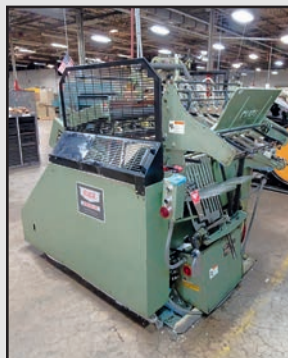
Kluge EHD14X22 Die Cutter and Foil Stamper

Auction Opens: Tuesday, December 14, 2021 at 8:00 a.m. (EST)