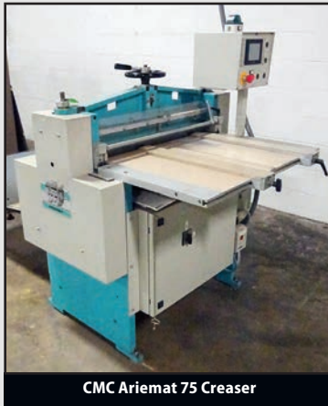
CMC Ariemat 75 Creaser