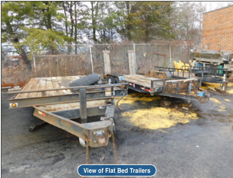
View of Flat Bed Trailers