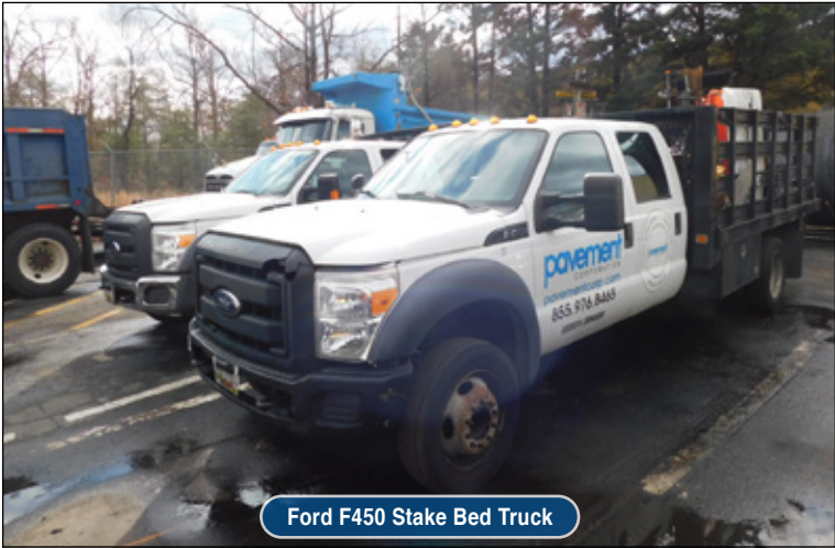
Ford F450 Stake Bed Truck