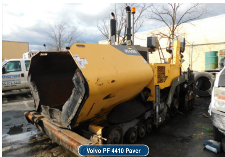
Volvo PF 4410 Paver

EQUIPMENT LOCATION: 2255 Pinefield Station, Waldorf, MD 20601