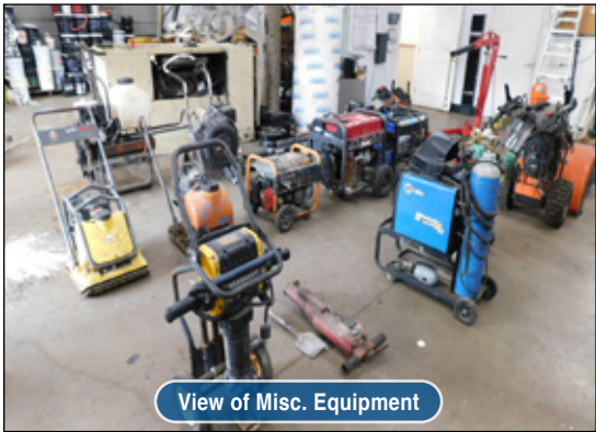
View of Misc. Equipment