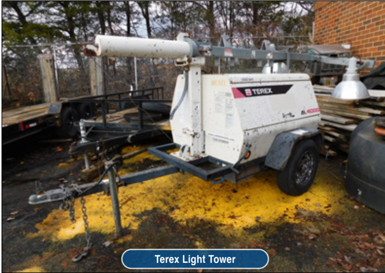
Terex Light Tower