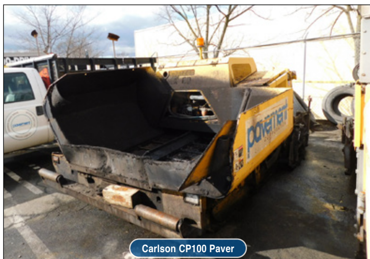
Carlson CP100 Paver