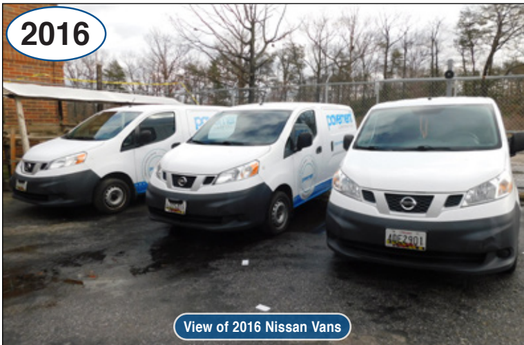
View of 2016 Nissan Vans