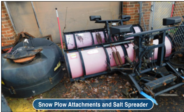
Snow Plow Attachments and Salt Spreader