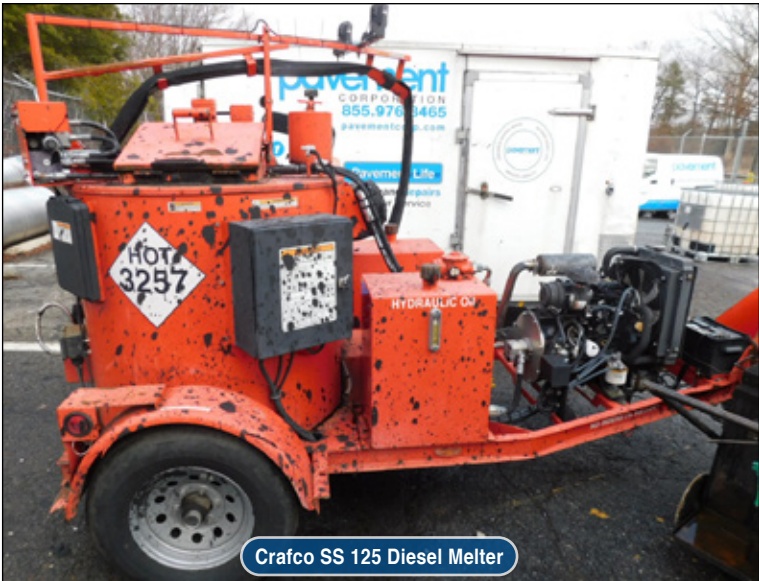
Crafcro SS 125 Diesel Melter