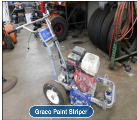
Graco Paint Striper