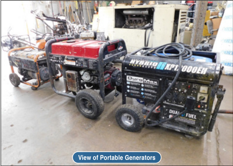
View of Portable Generators