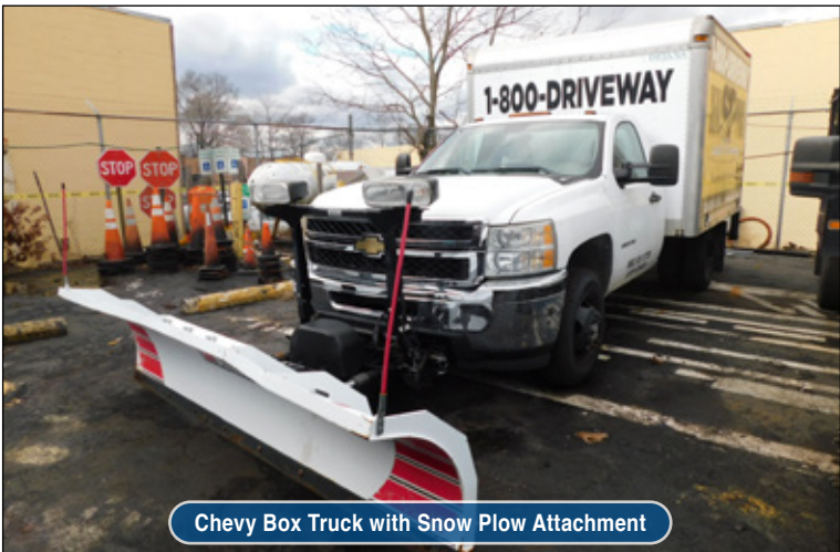
Chevy Box Truck with Snow Plow Attachment