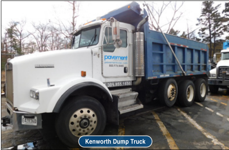
Kenworth Dump Truck