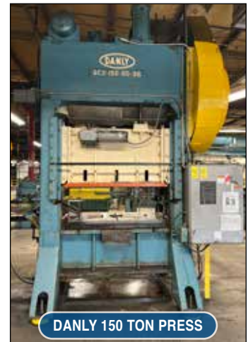
DANLY 150 TON PRESS