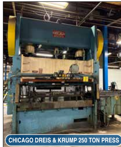
CHICAGO DREIS & KRUMP 250 TON PRESS