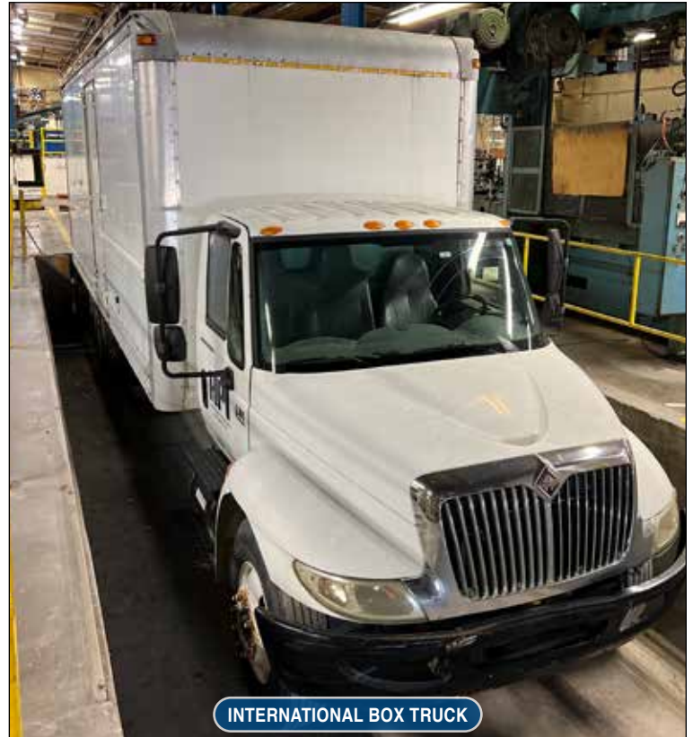
INTERNATIONAL BOX TRUCK

INTERNATIONAL 4300 TRUCK , VIN 1HTMMAAL46H206360 (New 2006) (14) 53' DRY VAN TRAILERS YALE 8,000-LB. FORKLIFT TRUCK , S/N F818V02747M (New 2014) TOYOTA 6,500-LB. LP GAS FORKLIFT TRUCK , S/N 7FGCU32 66724 KOMATSU FG25, 5,000-LB. LPG FORKLIFT TRUCK , S/N 256275A with Side Shift, Overhead Guard, Solid Cushion Tires YALE GLP050, 5,000-LB. LPG RIDER TYPE FORKLIFT TRUCK , S/N E177B1571U, with Side Shift, Solid Cushion Tires (4) YALE 3,000-LB. CAPACITY LP GAS FORKLIFT TRUCK , S/N C809V02969D, B809NC03098A, B809N03094A and S/N C809V02971D NISSAN MCPL02A25LV, 4,400-LB. LPG RIDER TYPE FORKLIFT TRUCK , S/N GPH02-9P1367, Solid Cushion Tires CROWN 30SP36TT, 3,000-LB. STANDING ELECTRIC RIDER TYPE NARROW AISLE FORKLIFT TRUCK , S/N 1A106606 GENIE Z-30/20, SELF-PROPELLED ELECTRIC TELESCOPING PLATFORM LIFT , S/N 1126 TEREX ELECTRIC SELF PROPELLED PLATFORM TYPE SCISSOR LIFT , S/N TS26, with Approx. 750-Lb. Capacity (15) FORKLIFT CLAMPS BIG JOE 1524-A5, 1,500-LB. F 750 750 CAPACITY DIE LIFT , S/N 35784 ADVANCE 320 HD, ELECTRIC WALK BEHIND FLOOR SCRUBBER