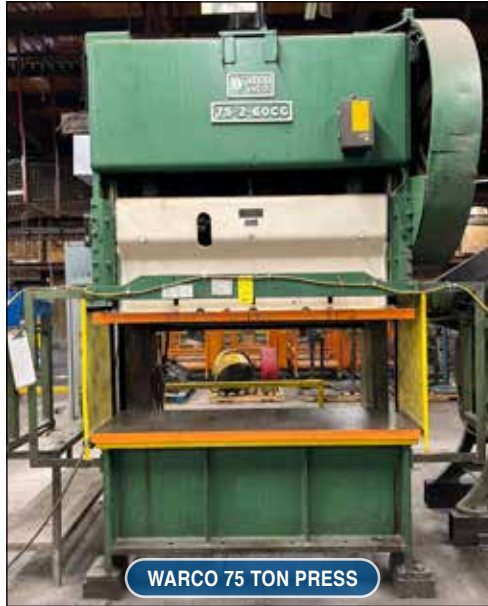
WARCO 75 TON PRESS