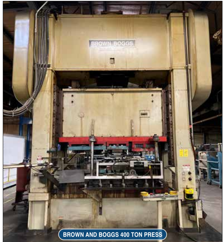
BROWN AND BOGGS 400 TON PRESS

ROUSSELLE NO. 2, 15-TON OBI PRESS , S/N 22817, with Air Clutch, Electrical Push Button Controls