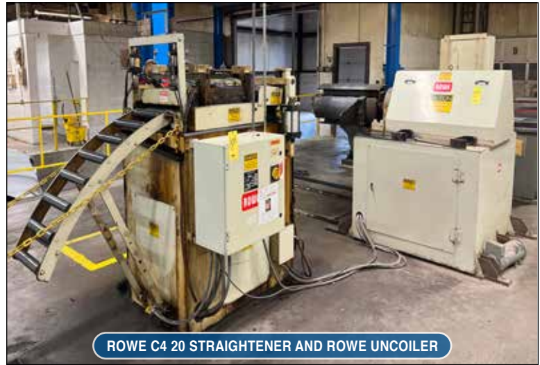
ROWE C4 20 STRAIGHTENER AND ROWE UNCOILER