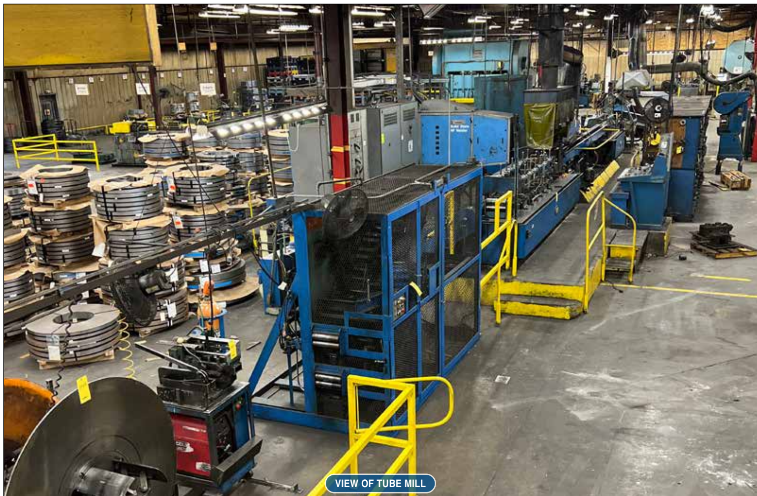
VIEW OF TUBE MILL