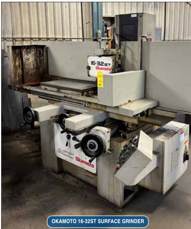
OKAMOTO 16-32ST SURFACE GRINDER

GROB 4V18, 18" VERTICAL BAND SAW, S/N 871 with Blade Welder and Blade Grinder