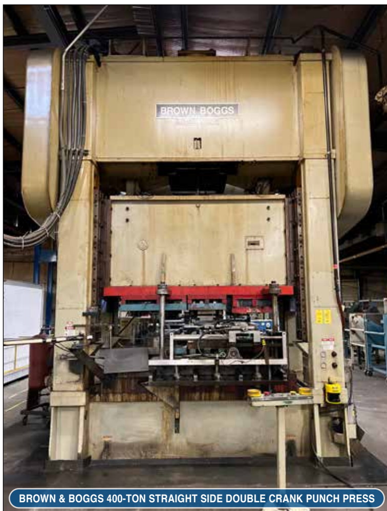
BROWN & BOGGS 400-TON STRAIGHT SIDE DOUBLE CRANK PUNCH PRESS

Contact Matt Gossett at 248.228.5880 with any questions