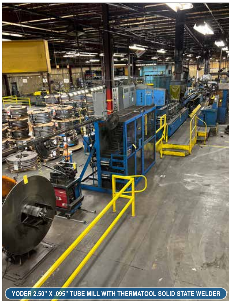
YODER 2.50" X .095" TUBE MILL WITH THERMATOOL SOLID STATE WELDER