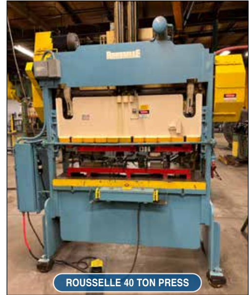
ROUSSELLE 40 TON PRESS