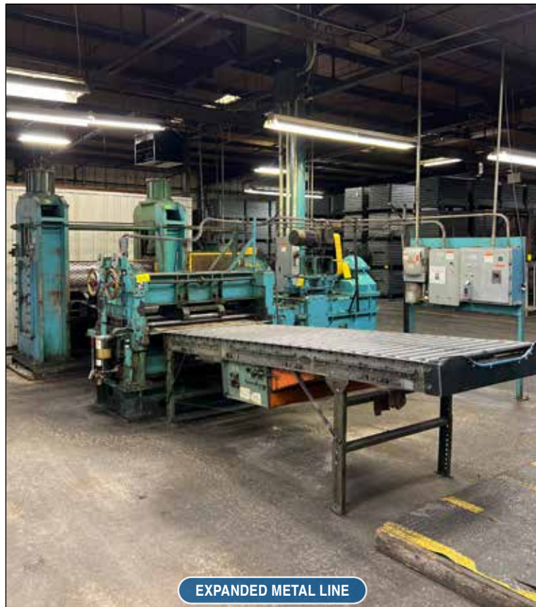
EXPANDED METAL LINE

TOOLING FOR THE FOLLOWING OD'S : .875", 1", 1.125", 1.250", 1.375"