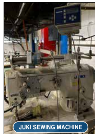
JUKI SEWING MACHINE