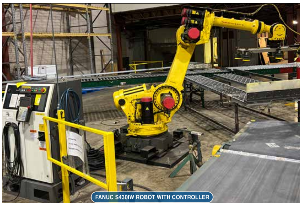
FANUC S430IW ROBOT WITH CONTROLLER