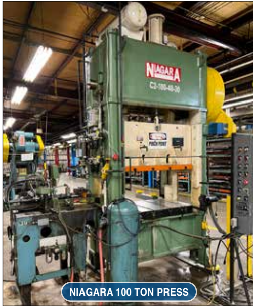
NIAGARA 100 TON PRESS