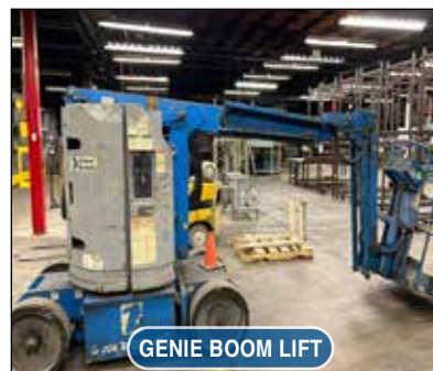
GENIE BOOM LIFT