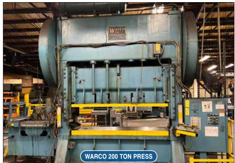
WARCO 200 TON PRESS