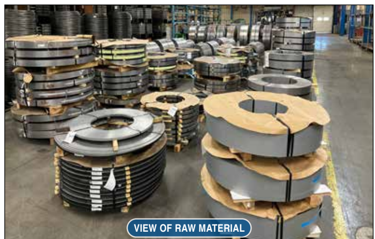
VIEW OF RAW MATERIAL

APPROX. 1,000' OF CEILING MOUNTED HEAVY DUTY MONORAIL CONVEYOR ITW GER-NA 8-GUN POWDER COAT SPRAY PAINT SYSTEM , with Portable Recovery Bins APPROX. 80'L X 84"W 2-LANE NATURAL GAS FIRED CONTINUOUS WASHING MACHINE , Welded Carbon Steel Construction, with Pumps and Blowers, Electrical Panel APPROX. 15' DRYING TUNNEL , 15' x 120+1 x 96"W Natural Gas Fired, with Spray Paint Booth, Galvanized Steel Bolted with PAINT POTS, GUNS, PUMPS & FLORESCENT LIGHTS (2) RANSBURG 10,000-VOLT ELECTRO-STATIC ROTARY PAINT BOOTHS APPROX. 80'L X 72"W 2-LANE WELDED CARBON STEEL DRYING OVEN