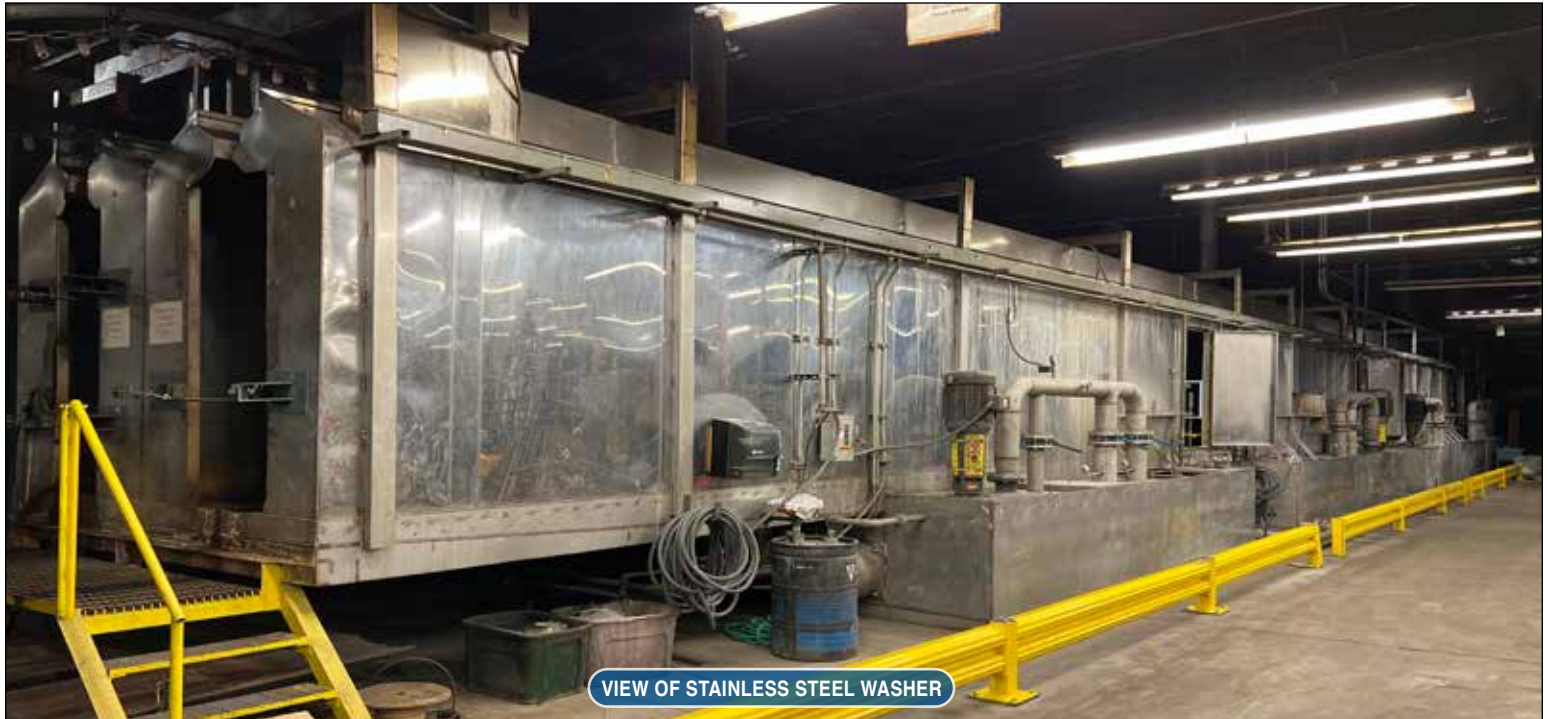
VIEW OF STAINLESS STEEL WASHER