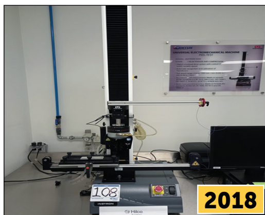
1 kN (225 Lb) Instron 3343 Universal Test Machine