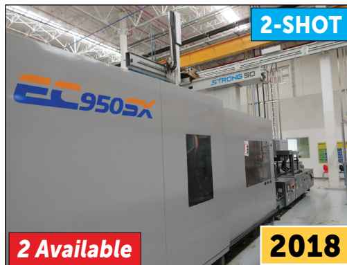
935 US Ton Toshiba 2-Shot Electric Injection Molders