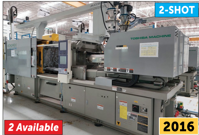
240 US Ton 3.7 oz / 4.7 oz Toshiba Injection Molders