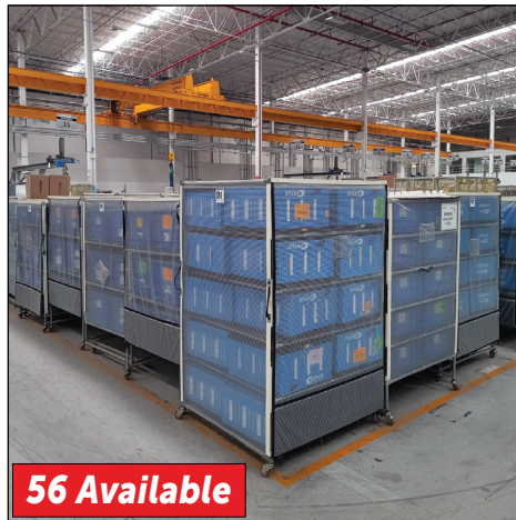
Storage Mobile Cars, Different Sizes