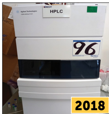
Agilent Technologies Spectrophotometer