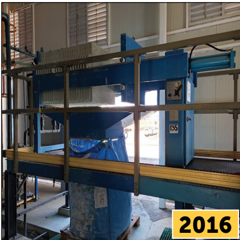
10 FT3 630 MM ACS Medio Ambiente Press Filter