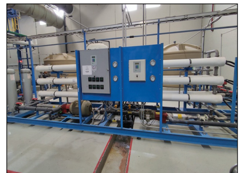
Reverse Osmosis System