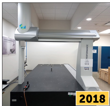
Hexagon Global Performance CMM