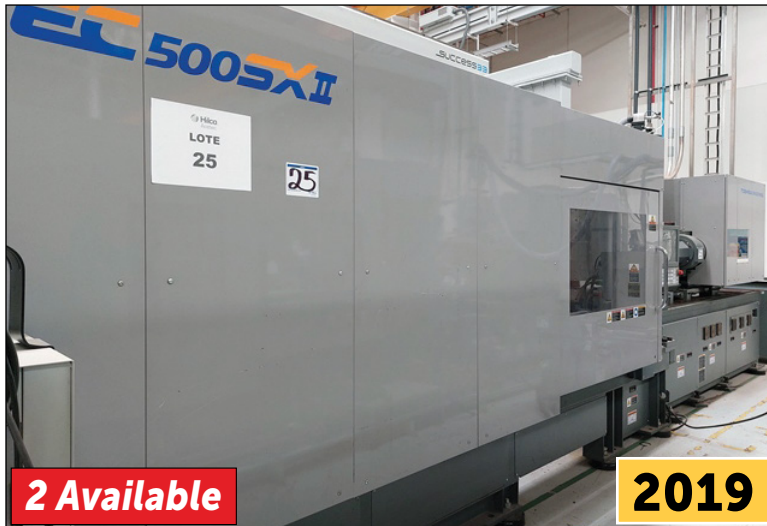
500 US Ton 31.9 oz Toshiba Electric Injection Molder