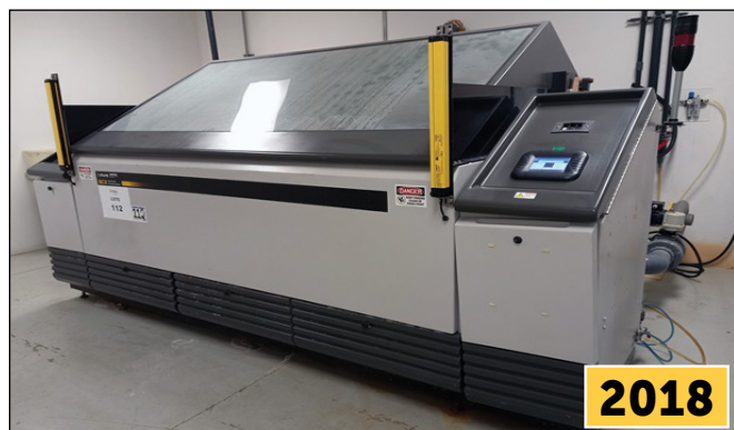
Atlas Material Testing Ametec Corrosion Cabinet