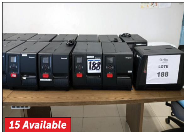
Honeywell PM 4220000 Thermic Printers