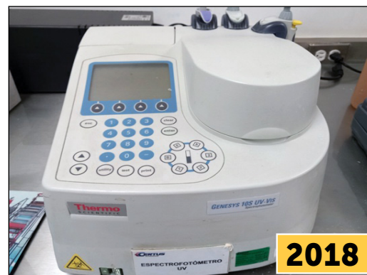
Thermo Scientific Spectrophotometer