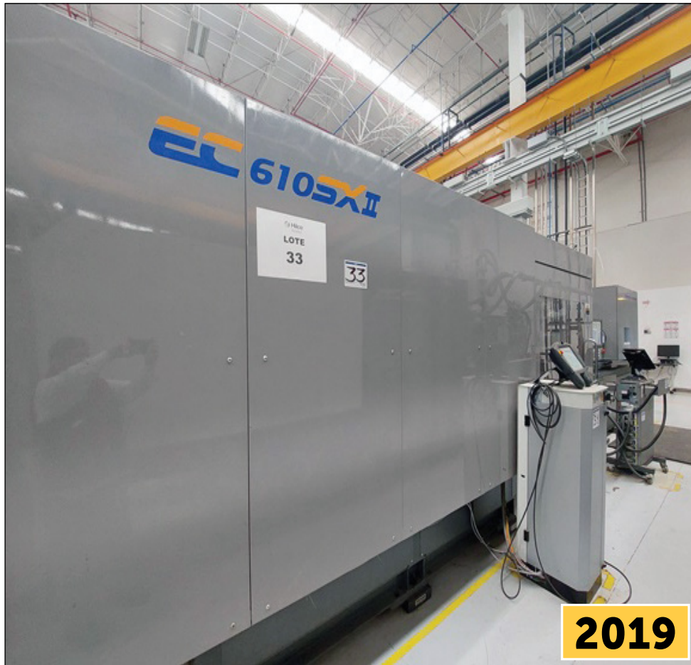
610 US Ton 31.9 oz Toshiba Injection Molder