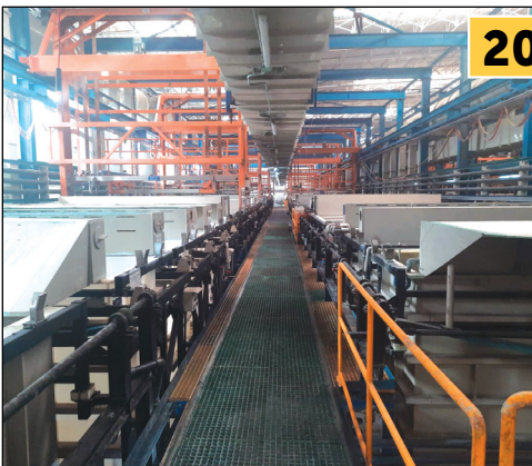
Views of Chrome Plating Line