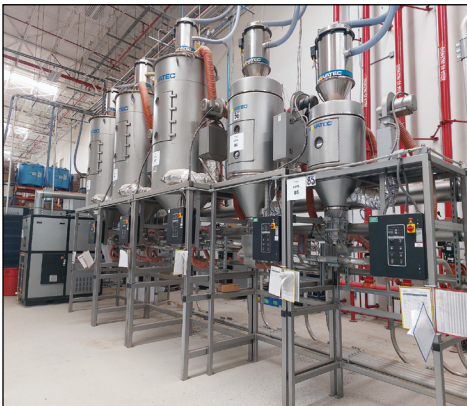
Novatec Central Drying Systems