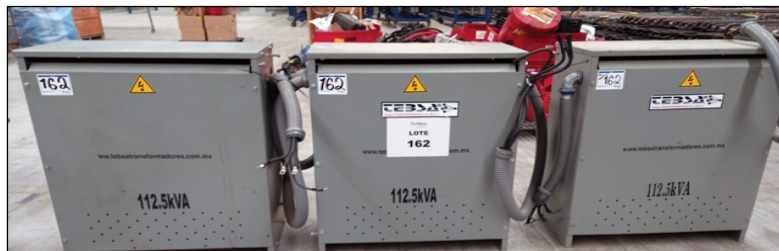
View of Electrical Transformer