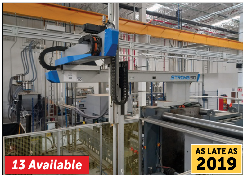
Sepro Full Servo Robot