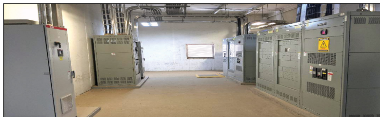
View of Switch Gear