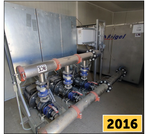
Frigel Cool Water Recirculation Pumping Station