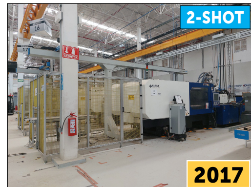
595 US Ton 10.2 oz/ 34.2 oz Haitian Injection Molder