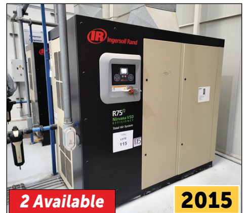
IR 100 HP Compressor