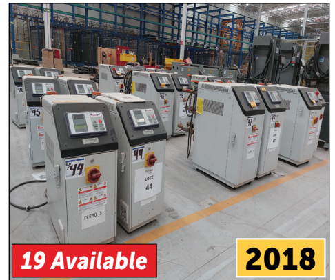
Frigel Temperature Controllers