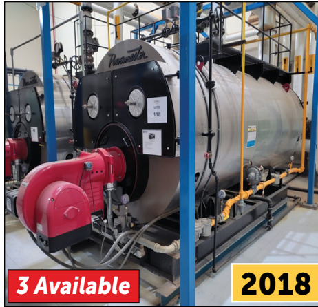
Powermaster WB-2A-3P-HW (FMG) Boiler