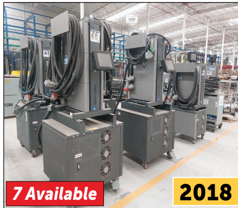
Gammaflux Hot Runner Controllers