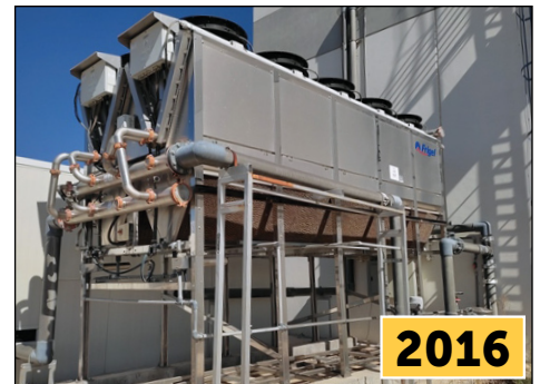
Frigel Ecodry Cooling Tower