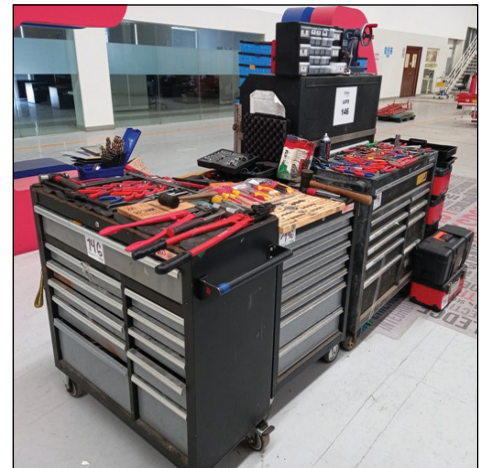
Manual Tooling Lot