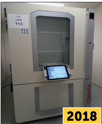
Climats Climate Chamber