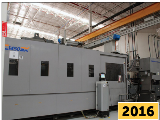
1,430 US Ton 140 oz Toshiba Injection Molder