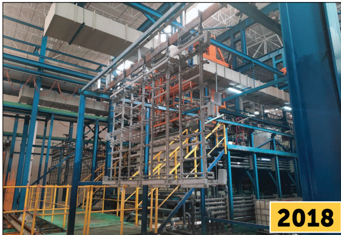
View of Chrome Plating Line

HUGE SCRAP OPPORTUNITY TO PURCHASE: 20 TONS OF COPPER+BUSS, 20 TONS OF NICKEL, 7 TONS OF TITANIUM