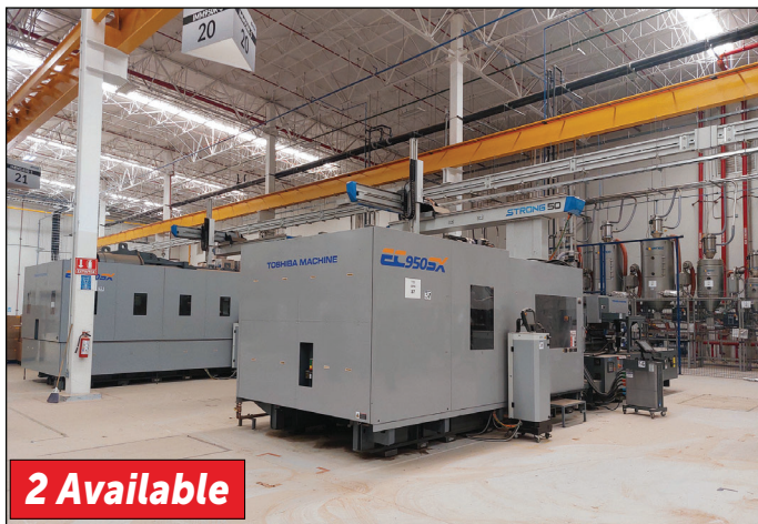
935 US Ton Toshiba 2-Shot Electric Injection Molders