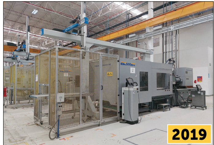
500 US Ton 31.9 oz Toshiba Injection Molder