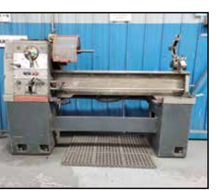
CLAUSING-COLCHESTER 13" x 55" Engine Lathe