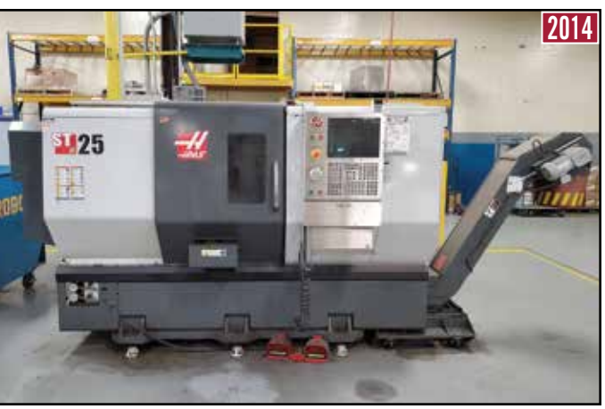
HAAS ST-25 CNC Turning Center

HAAS VF 9/50 CNC Vertical Machining Center