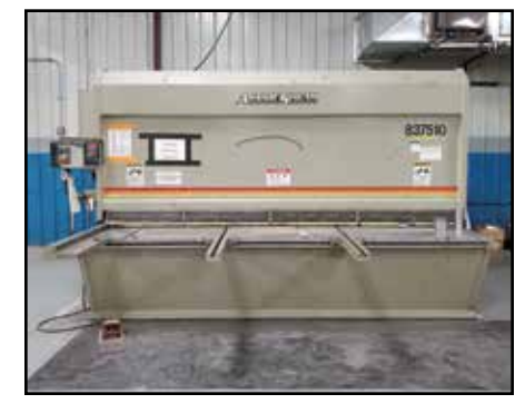
ACCURSHEAR .375" x 10' Hyd. Shear