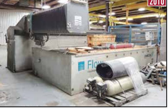
FLOW Hyperjet 50 Mach 3 4020B Water Jet Cutting Table