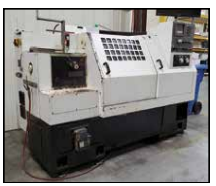
DELTA CNC Lathe