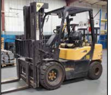
DAEWOO G30S-3 6,000-lb Forklift