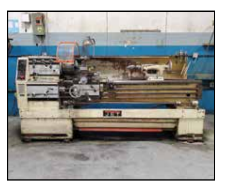
JET 1660-3PGH Geared Head Engine Lathe