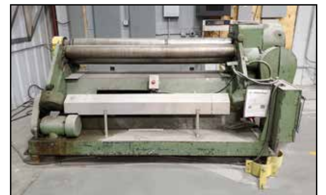
WYSONG 5' Power Pinch Roller