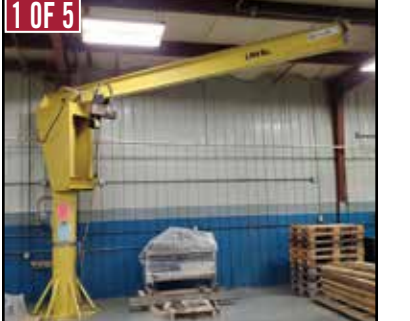
(5) 1/2-Ton Free-Standing Pedestal Jib Cranes