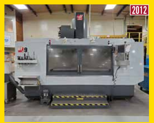
HAAS VF 9/50 CNC Vertical Machining Center

Inspection: Day Prior to Auction From 9AM-4PM