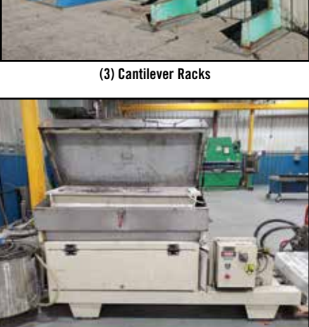
Horizontal Media Finish Tumbler