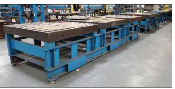
(12+) Various Size Acorn Type Tables