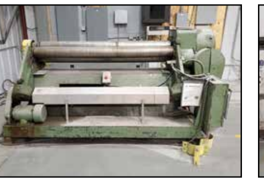
WYSONG 5' Power Pinch Roller