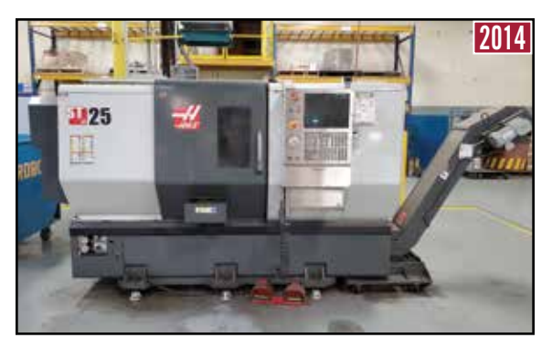
HAAS ST-25 CNC Turning Center