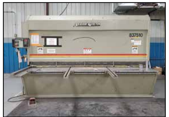
ACCURSHEAR .375" x 10' Hyd. Shear

(6) HYSTER, YALE & DAEWOO Forklifts to 12,000-lb. Capacity