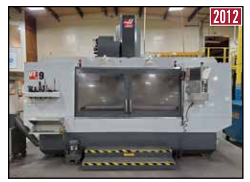
HAAS VF 9/50 CNC Vertical Machining Center