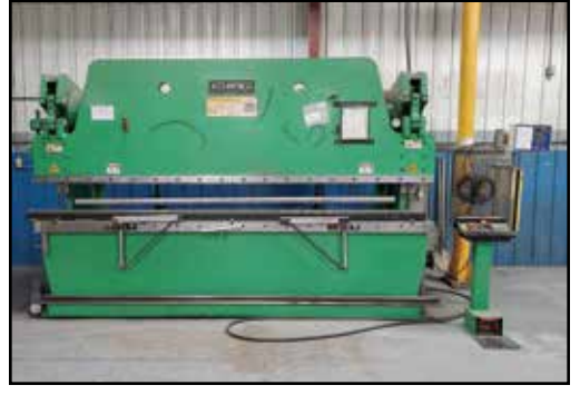
ACCURPRESS 175-Ton x 12' Press Brake