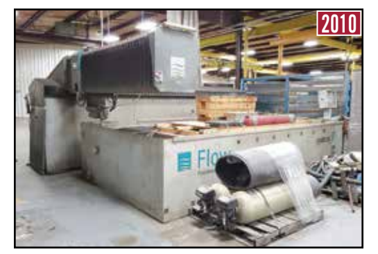
FLOW Hyperjet 50 Mach 3 4020B Water Jet Cutting Table