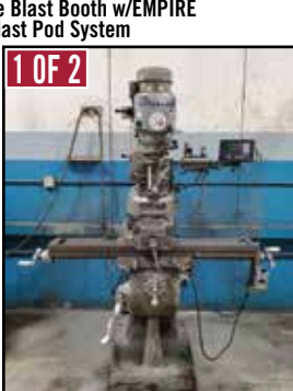
(2) SHARP Vertical Mills