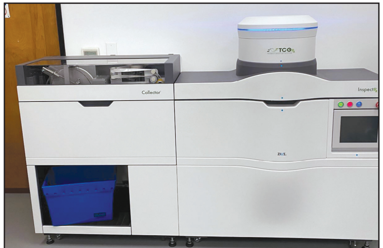
TCG RX – Accurate Pouch Verification Inspector Model 200, Collector Model 801

Collector separates pouches by patient, drug, or med cabinet, cuts rolls and secures pouches, dropping into tote for delivery.