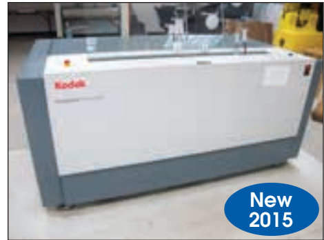
Kodak Trendsetter Platesetter CTP System