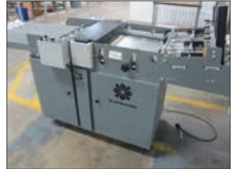
Sunraise Slitter w/ Multi Lane Delivery