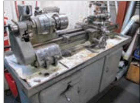
Southbend Lathe Model CL187RB