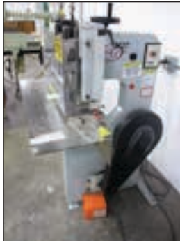
Deluxe 2-Head Wire Stitcher Model G20/M27