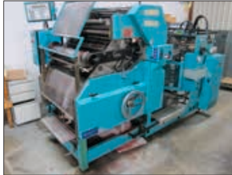
Heath Custom Numbering Press