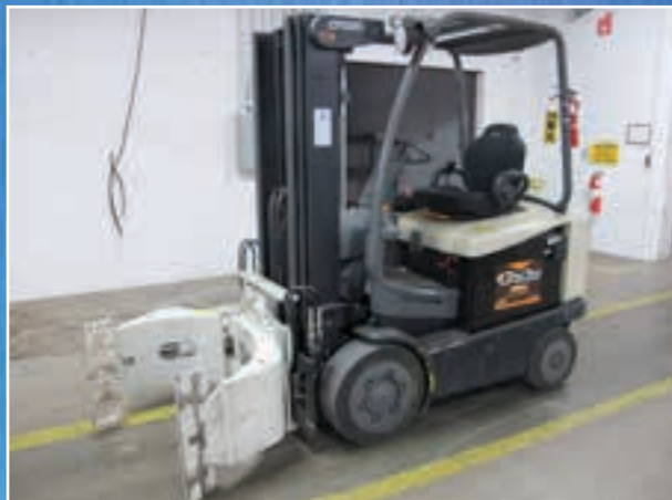
Crown Roll Clamp Truck Model FC4500