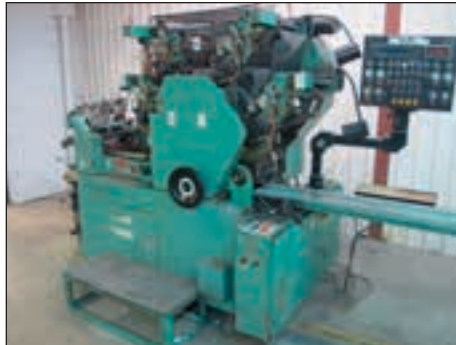
Halm Super Jet 4/C Envelope Press Model JP-FWOD