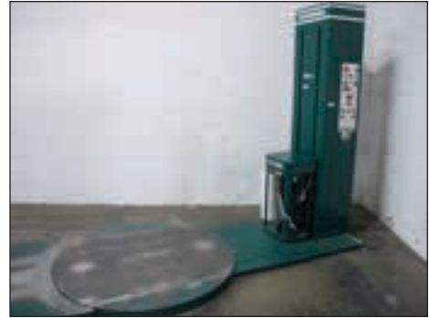
InfraPak Sidewinder Rotary Stretch Pallet Wrapper