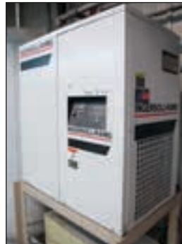
Ingersoll Rand Compressed Air Dryer Model DXR150