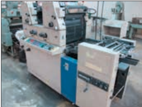
Ryobi 2-Color Press Model 3202MM