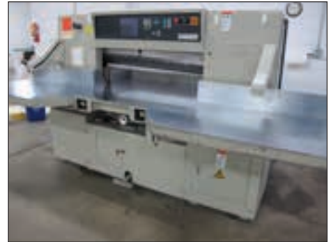
Saber Paper Cutter Model S115

Numbering, Perforating and Scoring, Royse Circulator