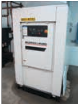
Ingersoll Rand 50 HP Rotary Screw Air Compressor Model SSR-EP50SE