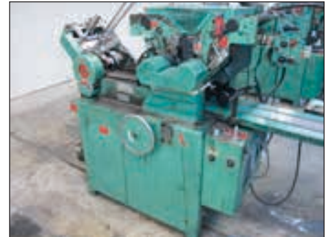
Halm Jet 2-Color Envelope Press Model JP-TWOD-6