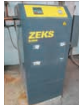
Zeks Heat Sink Compressed Air Dryer Model 250HSGA500