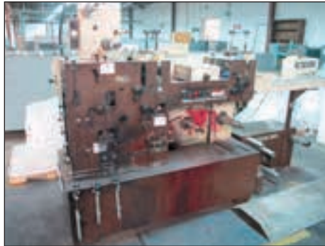
Mark Andy Flexo Press Model 833867-205