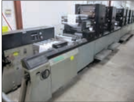
Didde Web Press Model DGS860MCM