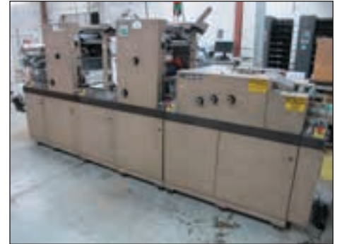
Didde 2-Unit Web Press Model Apollo MCP