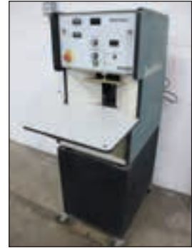
US Paper Counter Paper Counter Model Bantam-1