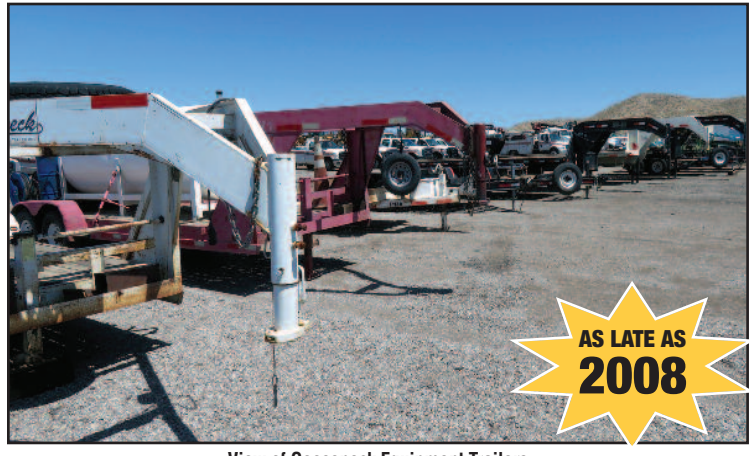
View of Gooseneck Equipment Trailers