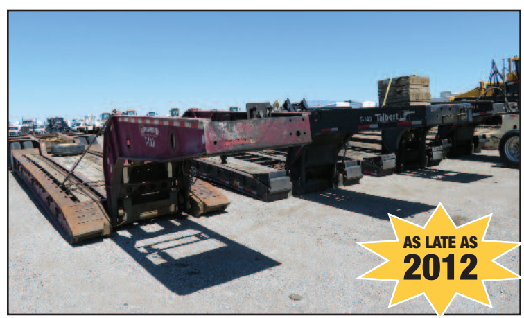
View of Heavy Haul Low Bed Trailers