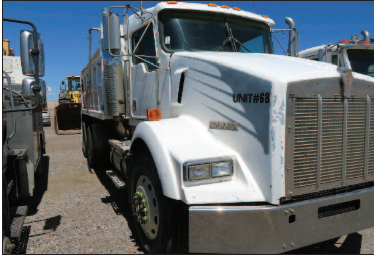
Kenworth T800 Dump Truck