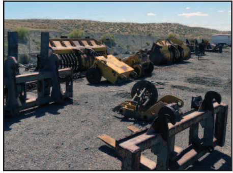
View of Buckets & Attachments