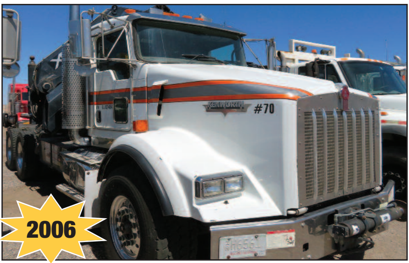
Kenworth T800 Tractor & HIAB 60Sep HT Crane