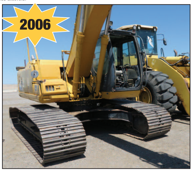
John Deere 200CLC Excavator