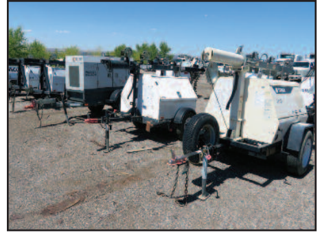
Light Plants & Generators

Storage Containers, Shop Equipment Misc. Buckets & Forks