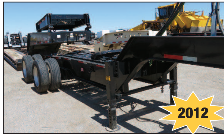
Talbert 65-Ton RGN w/Booster, Anchor & Jeep