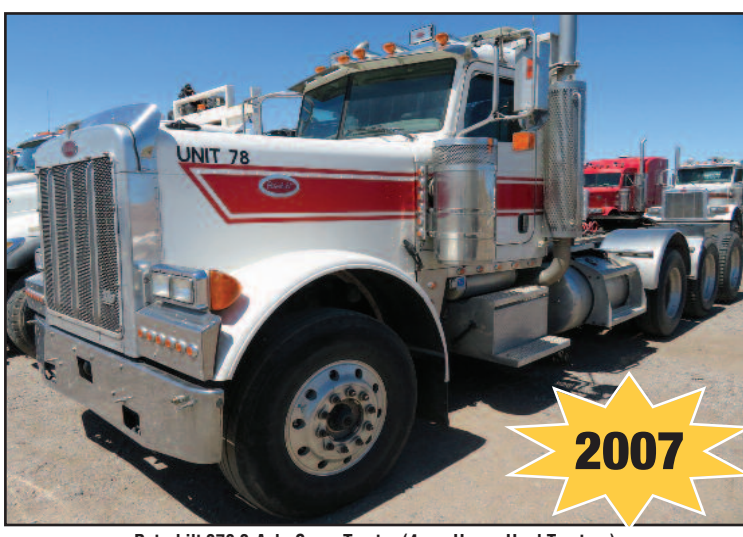
Peterbilt 379 3-Axle Conv. Tractor (4 are Heavy Haul Tractors)

(4) 2004 - 1999 Kenworth T800 Truck Tractors, 2-Axle Conv.