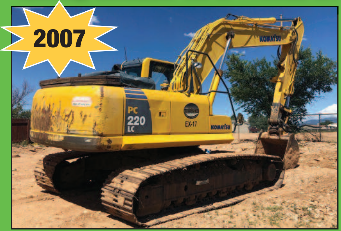
Komatsu PC200LC 8 Excavator