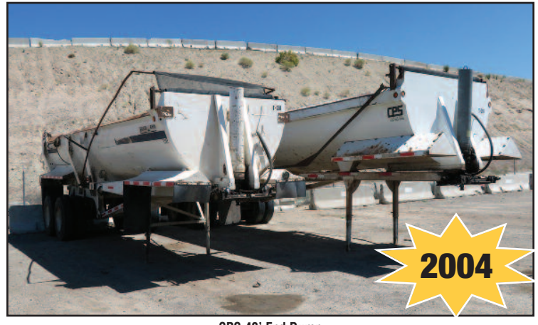
CPS 40' End Dump