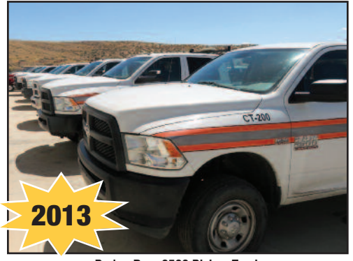
Dodge Ram 2500 Pickup Truck