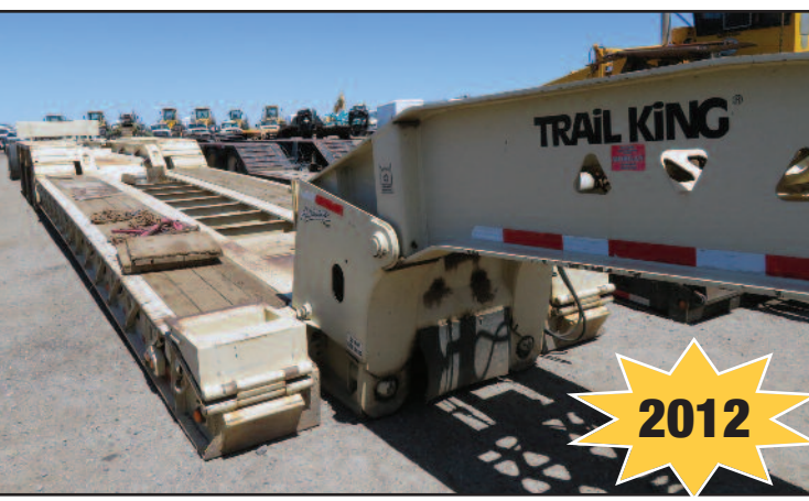
Trail King TK110DHG, 65-Ton RGN w/Booster, Anchor & Jeep