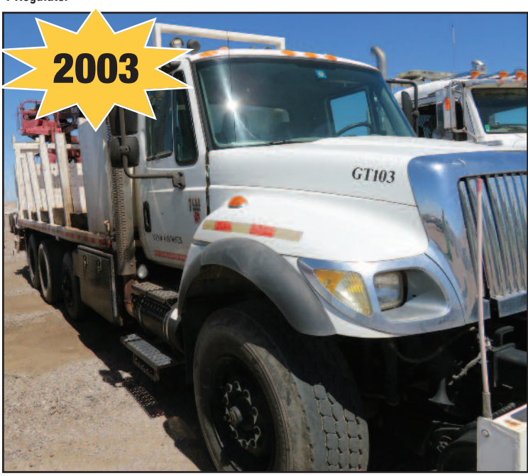
International 7600 24' Flatbed Truck, w/Prentice Crane & R.R. Conversion