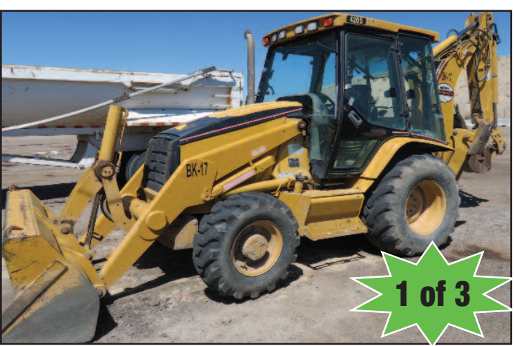
CAT 420D Backhoe/Loader

(3) 2002 - 2005 CAT 420D Backhoe/Loaders, (2) w/Quick Connect Buckets & Forks, S/Ns FDP22953, BLN12022 & FDP07764