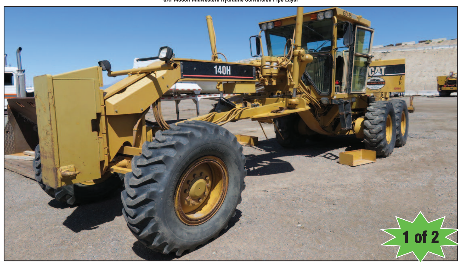
CAT 140H Grader, w/Rippers