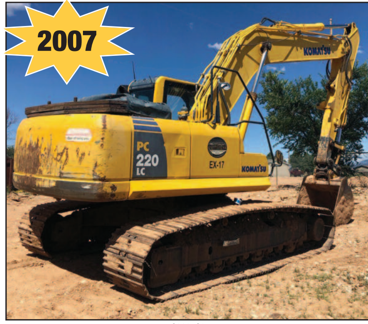
Komatsu PC200LC8 Excavator