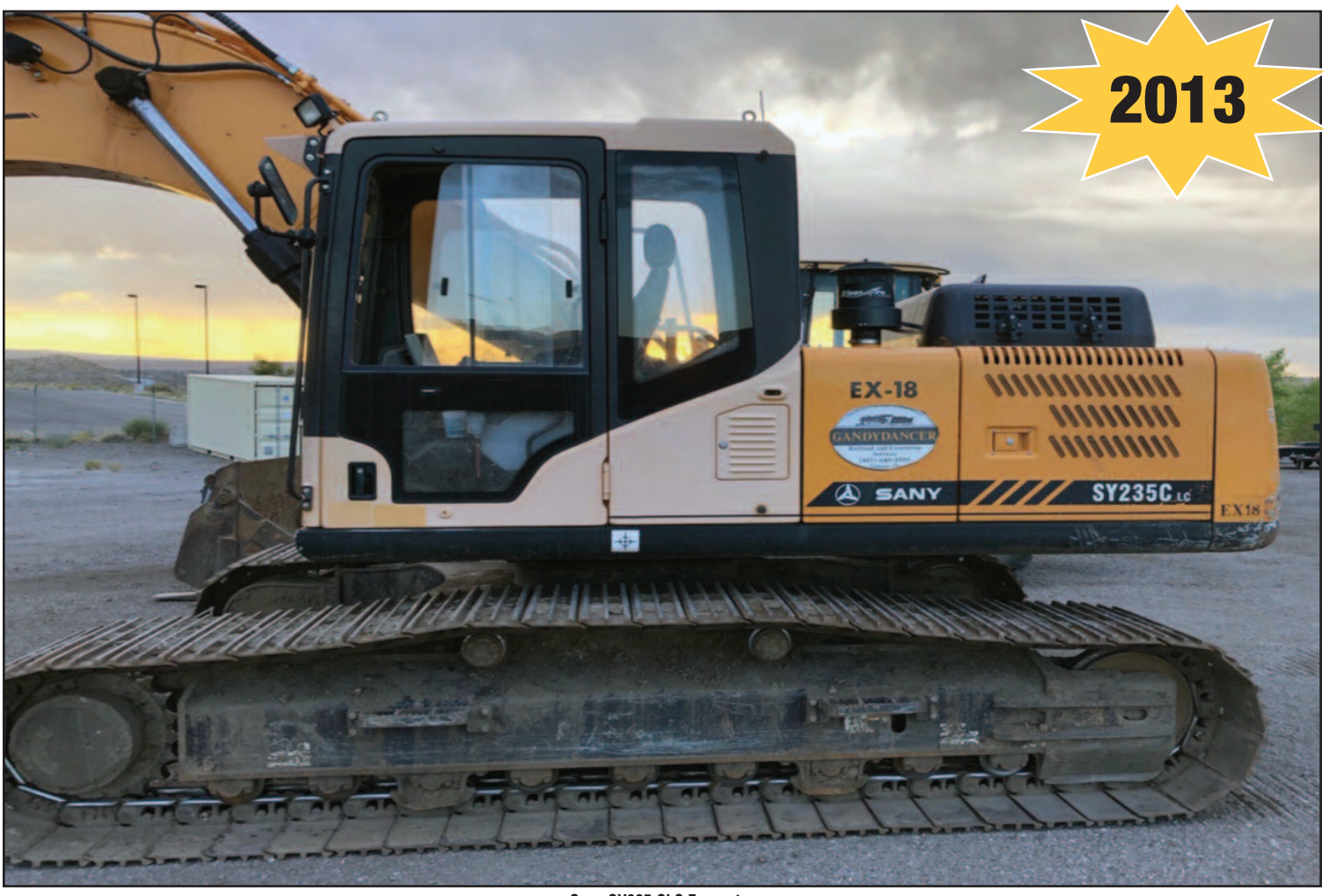
Sany SY235 CLC Excavator

2006 John Deere Mdl. 200CLC Excavator, Setup to Run Tie Inserter & Tamper, S/N CX506075