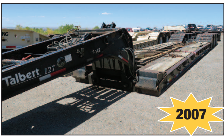
Talbert 55-Ton RGN Bed w/Anchor & Booster