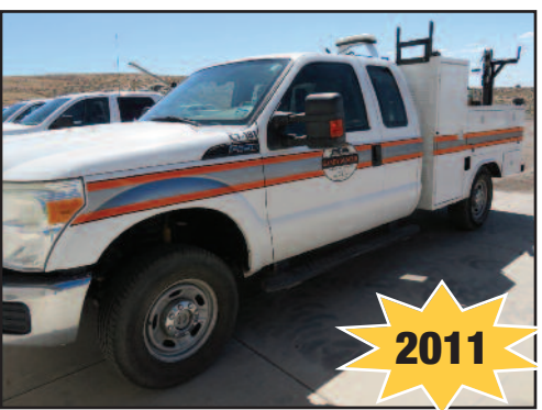
Ford F250SD Service Truck