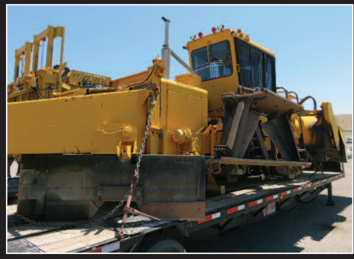
Kershaw 26-3-1 Regulator