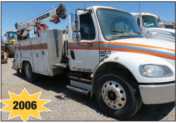
Freightliner M2 Business Class Service Truck