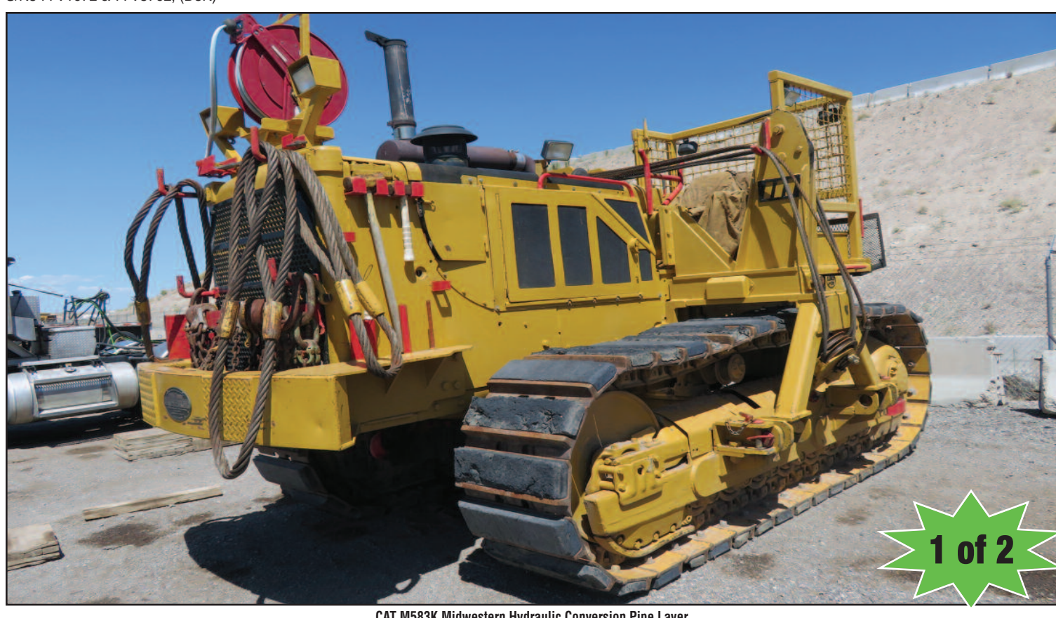
CAT M583K Midwestern Hydraulic Conversion Pipe Layer

(2) 2001 & 1999 CAT 140H Graders, w/Rippers, S/Ns 022K7104 & 22K013104