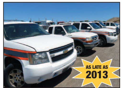
View of Pickups & Suburbans