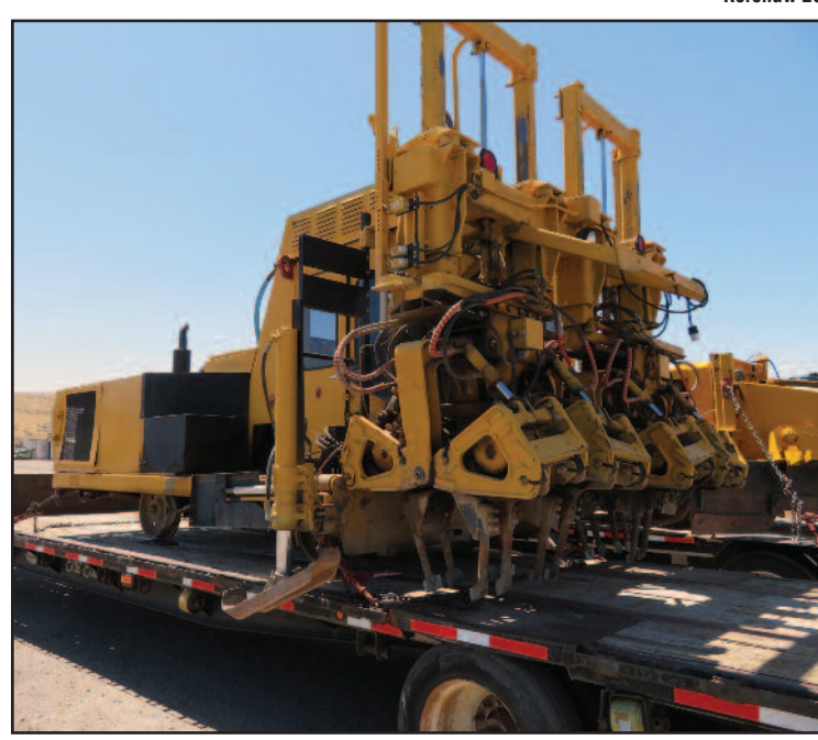
Jackson 2600 Tamper Ballast