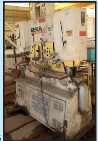
GEKA MDL. HYDRACROP 100/A IRONWORKER