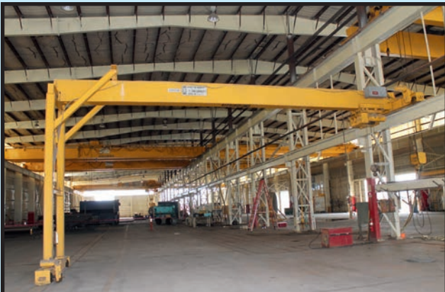
OMI 5 T. X 46'-5-3/4" SPAN SINGLE LEG GANTRY CRANE SYSTEM