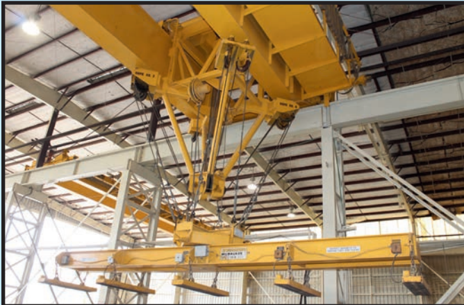
ZENAR 30 T. CAP. X 80' SPAN OVERHEAD BRIDGE CRANE W/ZENAR MILWAUKEE 20 T. CAP. MAGNETIC SHEET LIFT SYSTEM