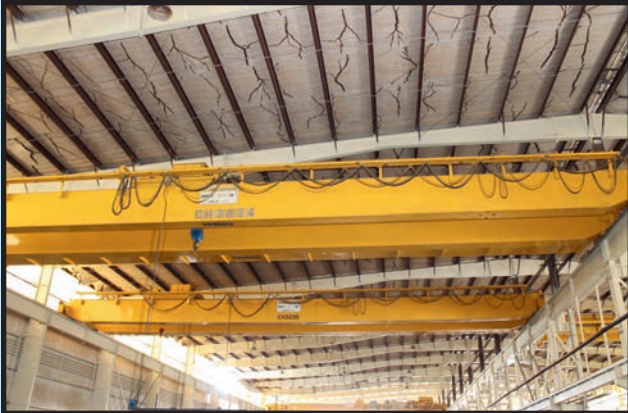
ZENAR 20 T. CAP. W/5 T. AUX. X 80' SPAN OVERHEAD BRIDGE CRANE