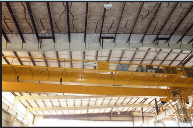
ZENAR 30 T. CAP. X 80' SPAN OVERHEAD BRIDGE CRANE W/ZENAR MILWAUKEE 20 T. CAP. MAGNETIC SHEET LIFT SYSTEM