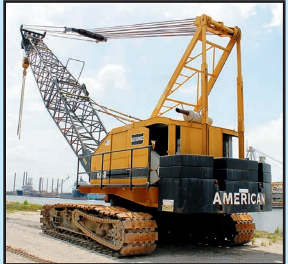
AMERICAN MDL. 9260 CRAWLER CRANE