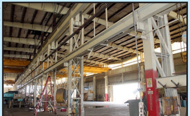
SAMPLE VIEW OF LARGE QUANTITY CRANE RUNWAYS

INSPECTION: Monday, October 14, 9:00 A.M. to 4:00 P.M.