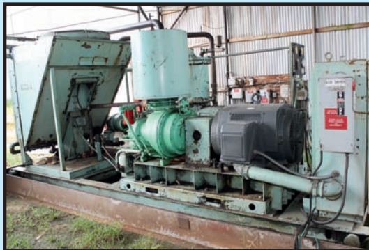
SULLAIR 300 HP ROTARY SCREW AIR COMPRESSOR

MILLER AND LINCOLN WELDING POWER SOURCES AND WIRE FEEDERS; KEEN ROD OVENS; MILLER AND HYPER THERM PORTABLE PLASMA CUTTERS; POLARIS 4WD VEHICLES; SHOP FANS; PLATE DOGS; NATURAL GAS SHOP HEATERS; MORE!