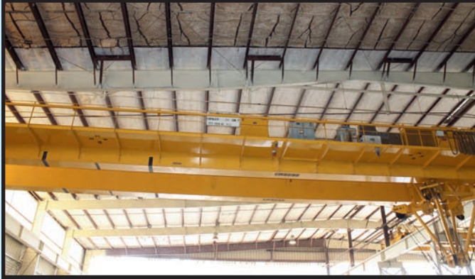
(1 OF 3) 80' SPAN ZENAR OVERHEAD BRIDGE CRANES

FEATURING: (13) OVERHEAD BRIDGE CRANES UP TO 40 T. X 80' SPAN; AMERICAN MDL. 9260 125 T. CRAWLER CRANE; CRANE BOOMS; (2) BERTSCH PLATE BENDING ROLLS UP TO 160" X 2.25" CAP.; PLUS WELDING POWER SOURCES, WIRE FEEDERS; PLASMA CUTTERS; POLARIS 4WD VEHICLES; FANS; PLATE DOGS; MORE!