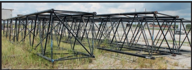
(6) BOOM SECTIONS FOR AMERICAN MDL. 9260 CRANE

TUESDAY, OCTOBER 15 BIDS START CLOSING AT 10:00 A.M.