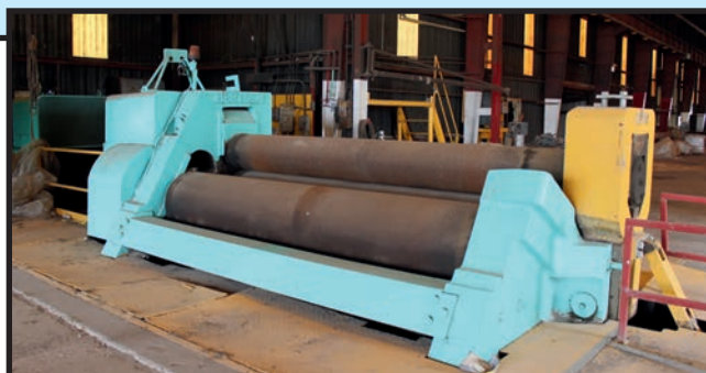
BERTSCH 160" X 2-1/4" PLATE BENDING ROLL

NOTE: Original build sheets and capacity charts for these rolls are available on our website.