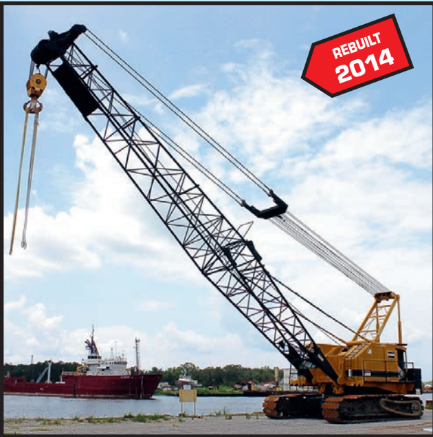
AMERICAN MDL. 9260 CRAWLER CRANE