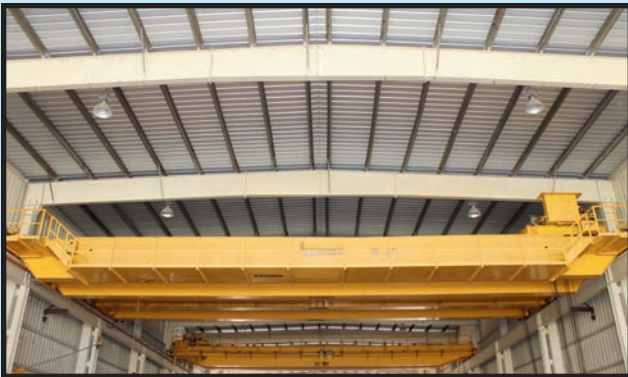
CRANE MANN 40 T. CAP. X 73'-11-1/4" SPAN OVERHEAD BRIDGE CRANE