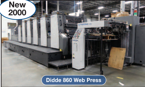
Didde 860 Web Press