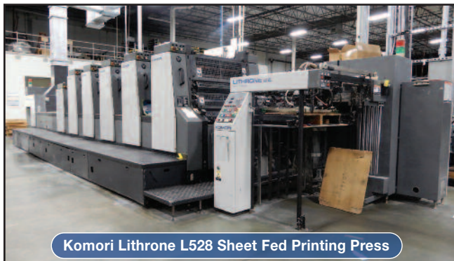
Komori Lithrone L528 Sheet Fed Printing Press

Komori Lithrone L528 Sheet Fed Printing Press , S/N 2028, (New 1999), 5-Color, 20" x 28" Sheet Size, Aqueous Coating & Infrared Dryer, (6) Ink Form Rollers; Royse Space Saver Circulation System; Prisco CH2002-A Circulation System, S/N 0165; Term Register System E-500 EES Micro Sprayer, Extended Delivery on Platform