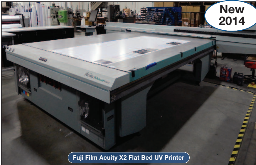
Fuji Film Acuity X2 Flat Bed UV Printer

Canon Image Runner IPF 8300 Wide Format Printer , 12-Color, 44" Wide Format