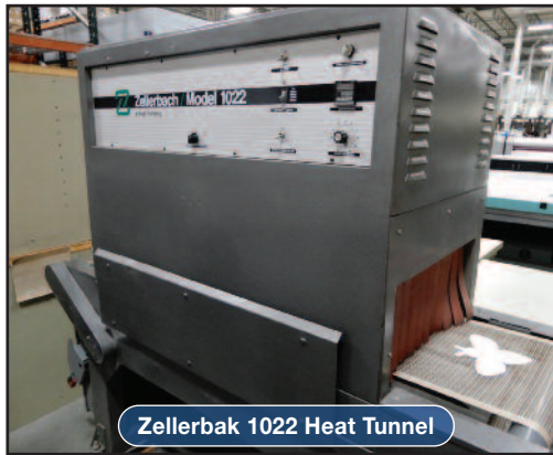
Zellerbak 1022 Heat Tunnel