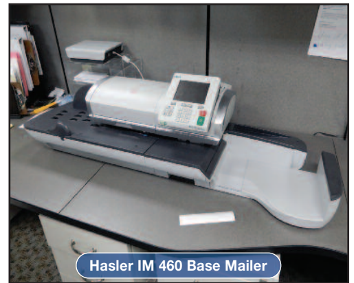
Hasler IM 460 Base Mailer