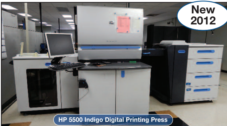
HP 5500 Indigo Digital Printing Press

OKI Pro 900 DP Pro Color Digital Envelope Printing Press , (New 2011), 12" x 18" Max. Paper Size, Banner Print to 47", 12" Feeder, Belt Conveyor