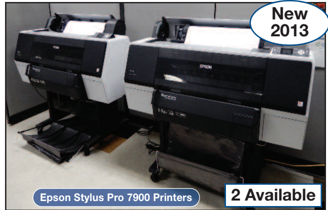
Epson Stylus Pro 7900 Printers