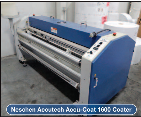
Neschen Accutech Accu-Coat 1600 Coater