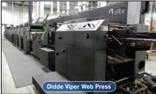
Didde Viper Web Press