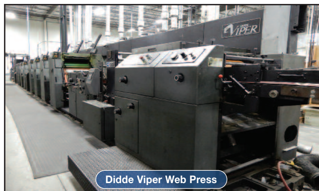
Didde Viper Web Press

Ryobi 3200 MCD Off-Set Printing Press , S/N 4982, 1-Color w/T51 Swing Away Color Head, 13-3/8" x 17-3/4" Sheet Cap.