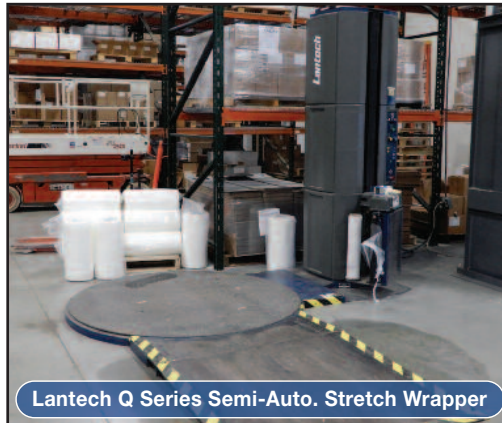
Lantech Q Series Semi-Auto. Stretch Wrapper