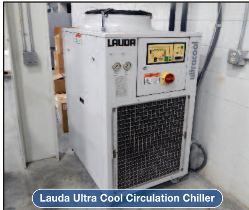
Lauda Ultra Cool Circulation Chiller