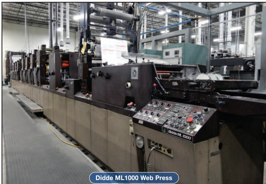
Didde ML1000 Web Press