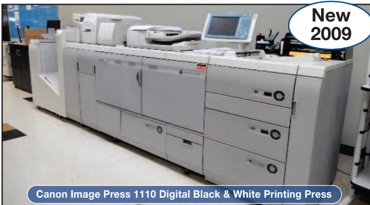
Canon Image Press 1110 Digital Black & White Printing Press