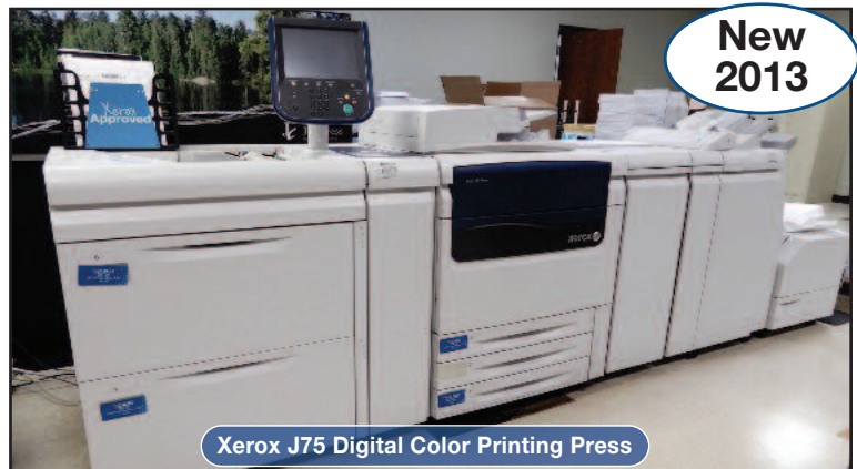
Xerox J75 Digital Color Printing Press