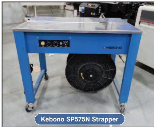
Kebono SP575N Strapper