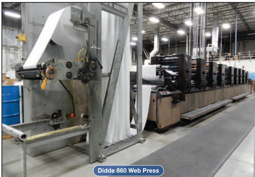
Didde 860 Web Press