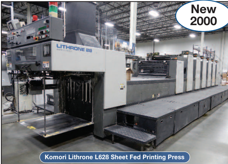
Komori Lithrone L628 Sheet Fed Printing Press