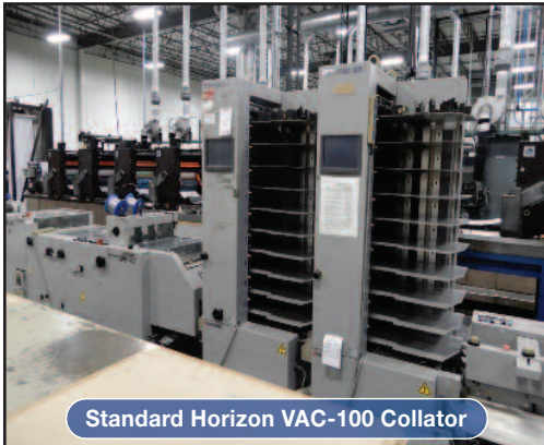
Standard Horizon VAC-100 Collator