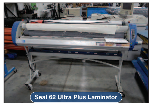
Seal 62 Ultra Plus Laminator