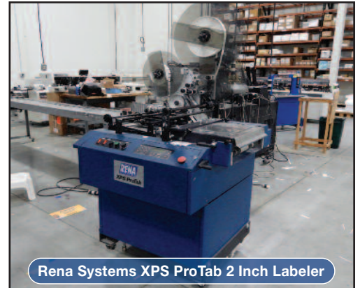
Rena Systems XPS ProTab 2 Inch Labeler