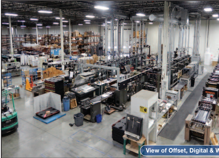
View of Offset, Digital & Wide-Format Printing Facility

INSPECTION: Day Prior to Auction or By Appointment Only INSPECTION LOCATION: 785 24th Avenue SW, Owatonna, MN 55060