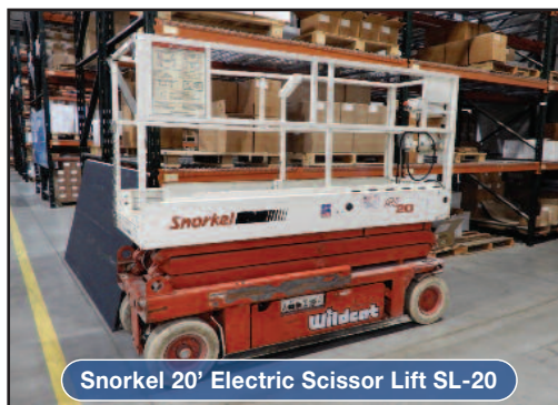
Snorkel 20' Electric Scissor Lift SL-20