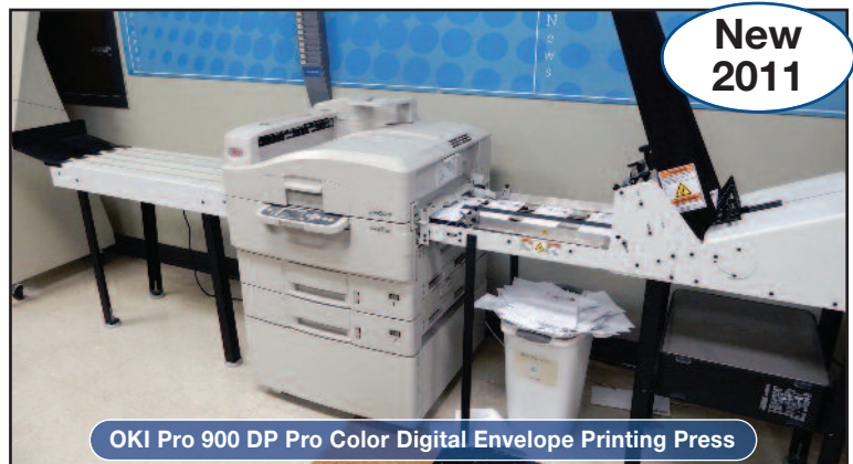
OKI Pro 900 DP Pro Color Digital Envelope Printing Press