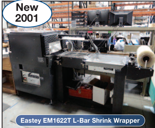
Eastey EM1622T L-Bar Shrink Wrapper