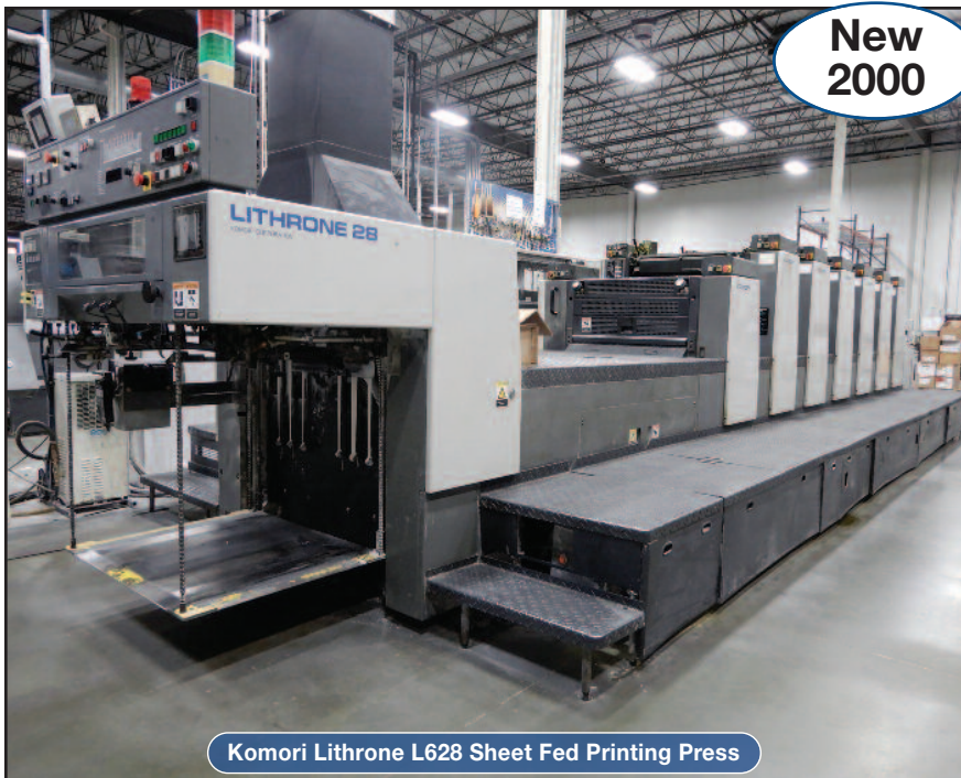
Komori Lithrone L628 Sheet Fed Printing Press