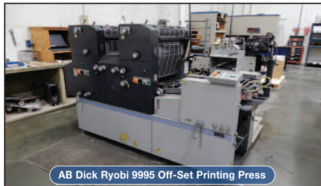
AB Dick Ryobi 9995 Off-Set Printing Press