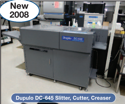
Dupulo DC-645 Slitter, Cutter, Creaser