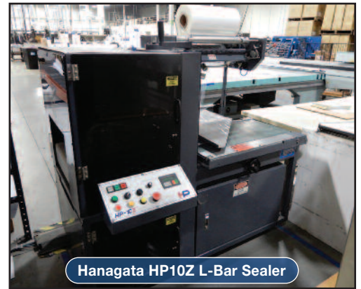
Hanagata HP10Z L-Bar Sealer