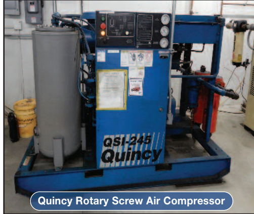
Quincy Rotary Screw Air Compressor