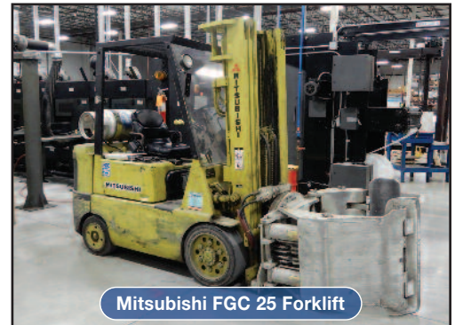
Mitsubishi FGC 25 Forklift