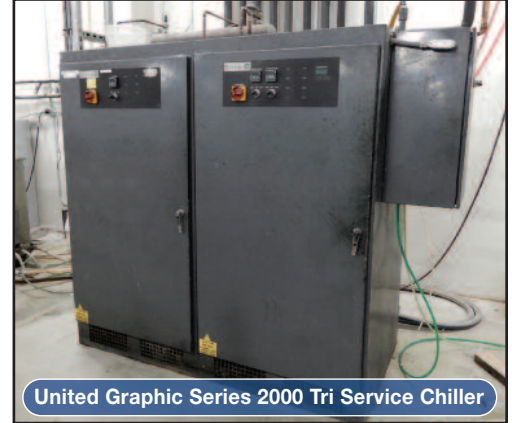
United Graphic Series 2000 Tri Service Chiller