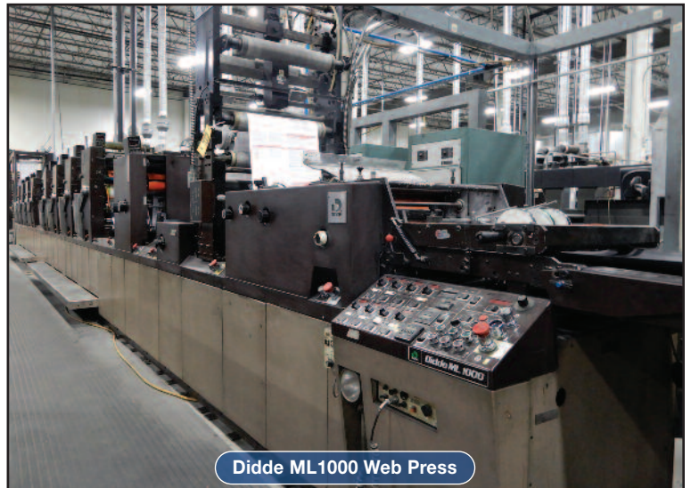
Didde ML1000 Web Press