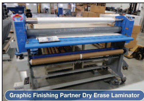
Graphic Finishing Partner Dry Erase Laminator