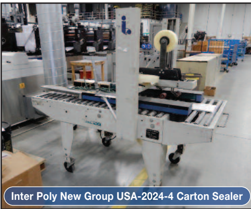
Inter Poly New Group USA-2024-4 Carton Sealer