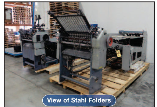
View of Stahl Folders