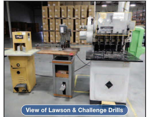
View of Lawson & Challenge Drills