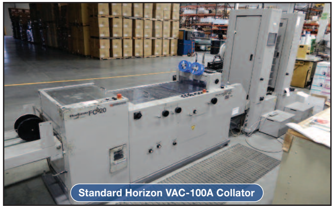
Standard Horizon VAC-100A Collator

Challenge MF Single Head Drill , S/N 13656, 31" x 18" Table, Foot Switch Control, Motor & Controls