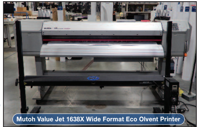
Mutoh Value Jet 1638X Wide Format Eco Olvent Printer