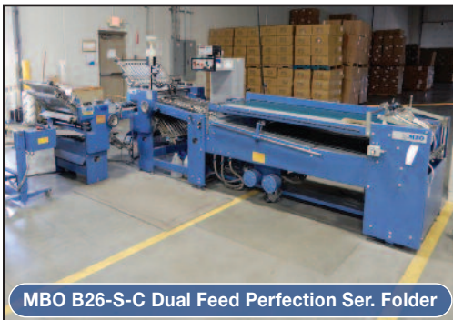
MBO B26-S-C Dual Feed Perfection Ser. Folder

Stahl 1426A-C-3 Continuous Feed Folder , S/N 150KA0004; Stahl 1426A-45 Parts Folder, S/N 151KA0004; Stahl 2TF56/4KC Folder; Stahl Stacker Stahl RF56V Folder , S/N 34209-137134