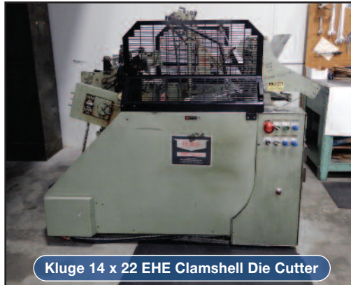
Kluge 14 x 22 EHE Clamshell Die Cutter