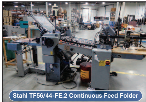
Stahl TF56/44-FE.2 Continuous Feed Folder