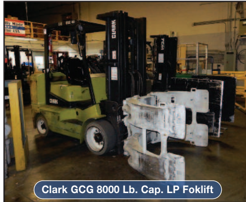
Clark GCG 8000 Lb. Cap. LP Foklift