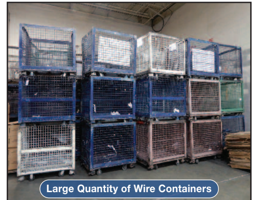
Large Quantity of Wire Containers

Register to Bid Online at: www.pplaction.com