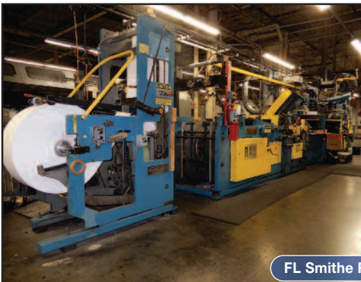
FL Smithe RAWA 800 EPM Roll Fed Envelope Printing and Converting Machines