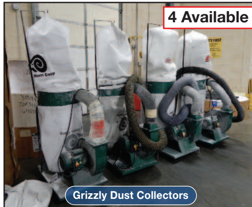
Grizzly Dust Collectors