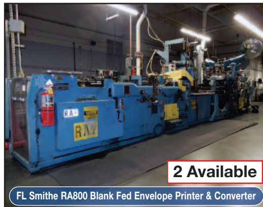
FL Smithe RA800 Blank Fed Envelope Printer & Converter