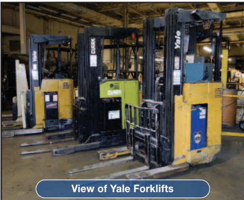
View of Yale Forklifts