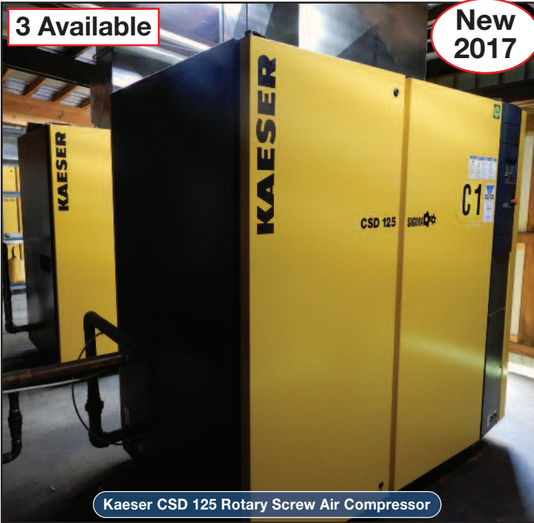
Kaeser CSD 125 Rotary Screw Air Compressor