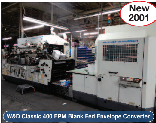
W&D Classic 400 EPM Blank Fed Envelope Converter