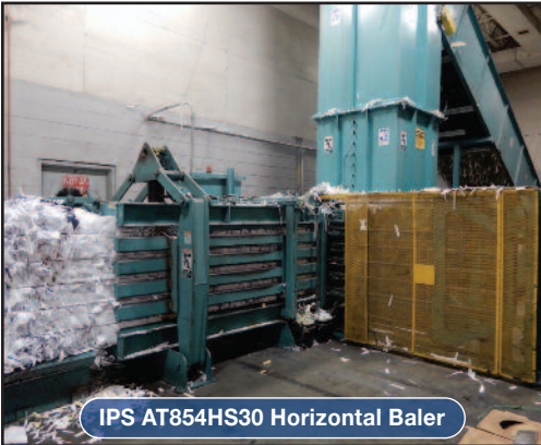
IPS AT854HS30 Horizontal Baler