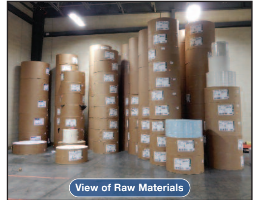
View of Raw Materials