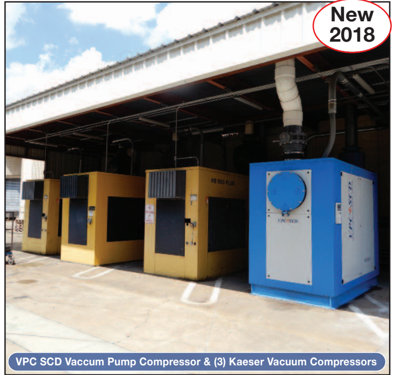
VPC SCD Vaccum Pump Compressor & (3) Kaeser Vacuum Compressors