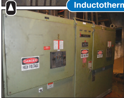
Inductotherm Furnace System

DON'T MISS THIS AUCTION! Bid Online October 24 thru October 31