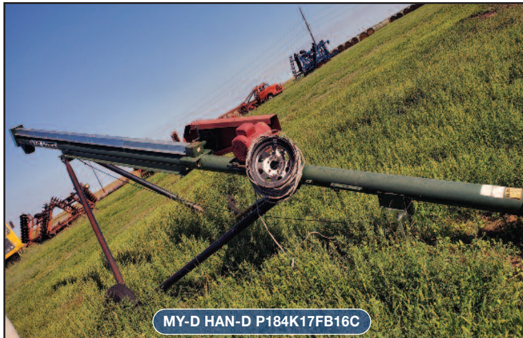
MY-D HAN-D P184K17FB16C

(10) Deer Feeders (5) Ground Deer Stands (3) Vertical Deer Stands Plywood Deer Blind/Shed Duck Blinds, Round, w/Grass Siding