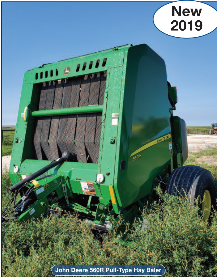
John Deere 560R Pull-Type Hay Baler