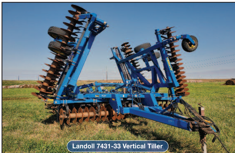
Landoll 7431-33 Vertical Tiller