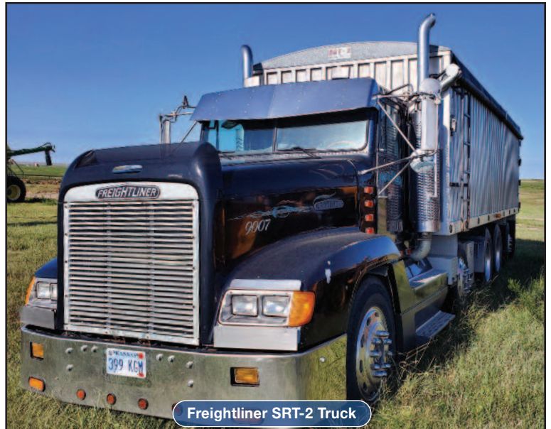
Freightliner SRT-2 Truck