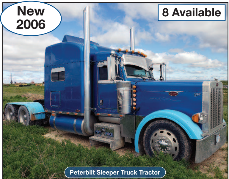
Peterbilt Sleeper Truck Tractor