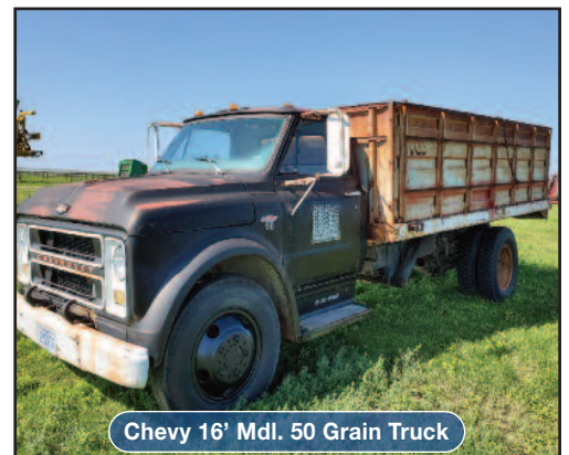
Chevy 16' Mdl. 50 Grain Truck