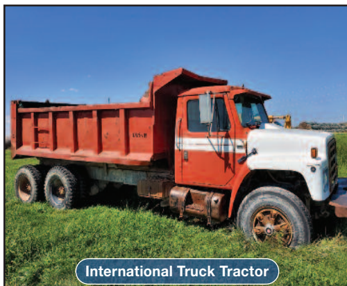
International Truck Tractor