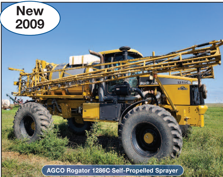
AGCO Rogator 1286C Self-Propelled Sprayer