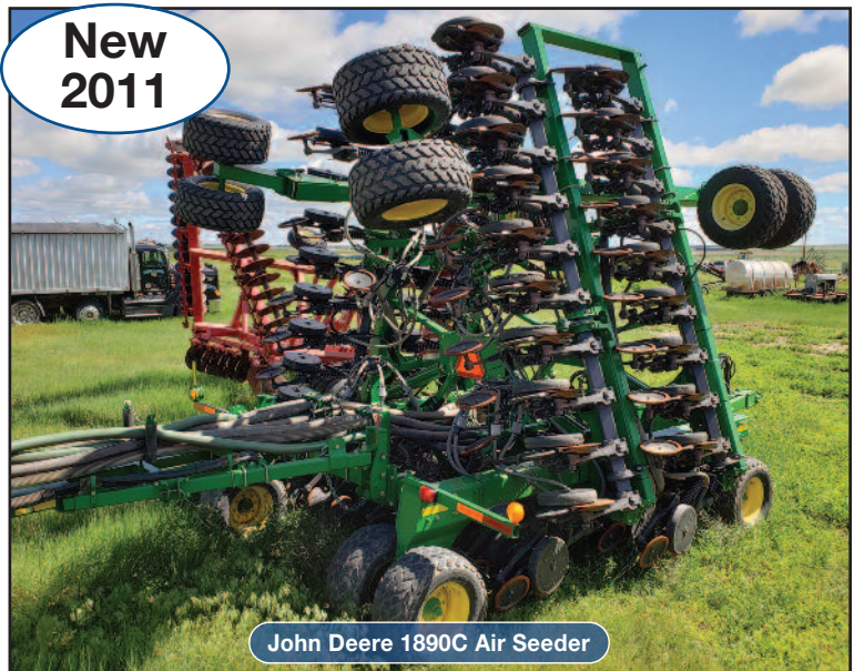
John Deere 1890C Air Seeder