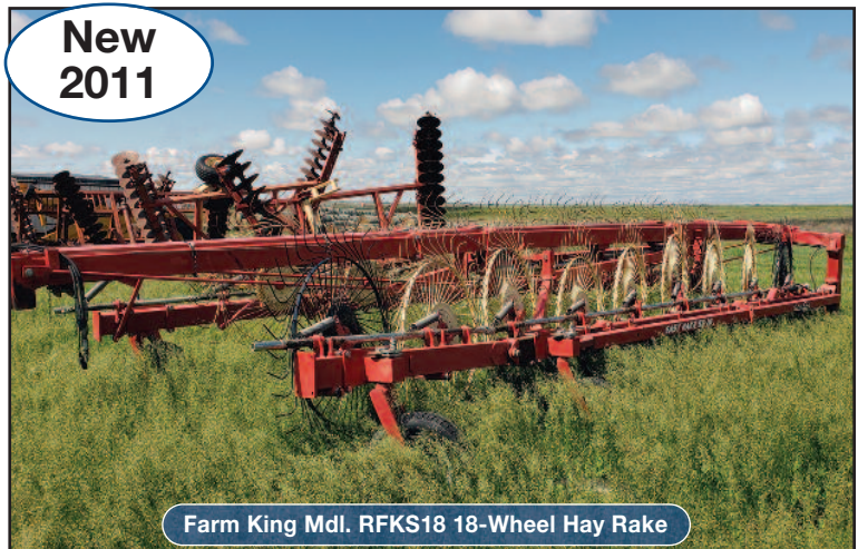
Farm King Mdl. RFKS18 18-Wheel Hay Rake

AUCTIONEER'S NOTE: All items are sold As Is Where Is. We have noted certain deficiencies as they were reported to us. As always we encourage all buyers to fully inspect all assets prior to purchase. All sales are final.