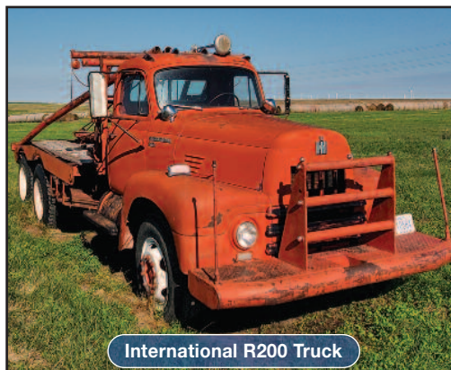
International R200 Truck