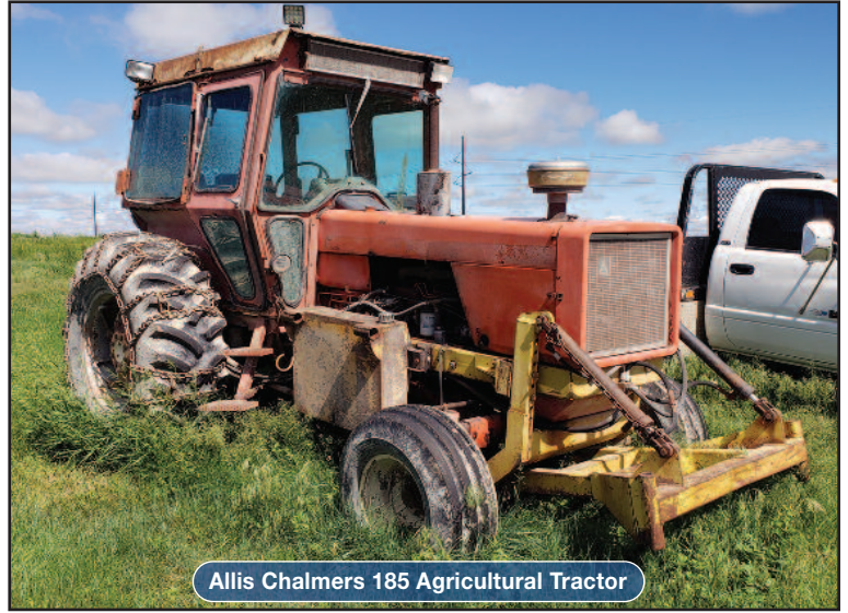
Allis Chalmers 185 Agricultural Tractor