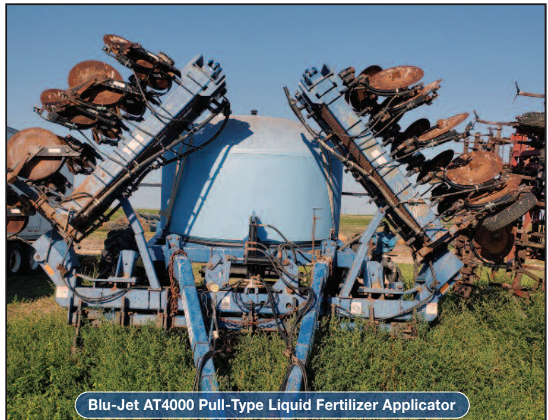
Blu-Jet AT4000 Pull-Type Liquid Fertilizer Applicator