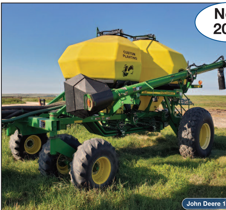
John Deere 1890C Air Seeder