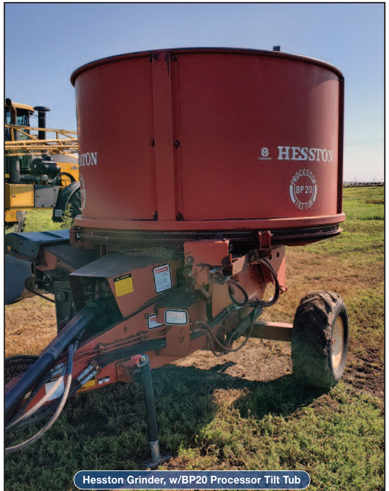
Hesston Grinder, w/BP20 Processor Tilt Tub