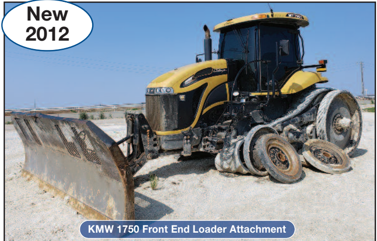
KMW 1750 Front End Loader Attachment