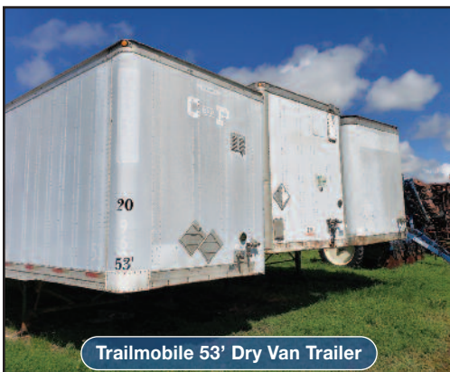
Trailmobile 53' Dry Van Trailer