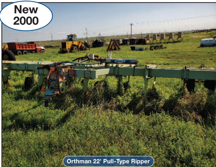
Orthman 22' Pull-Type Ripper