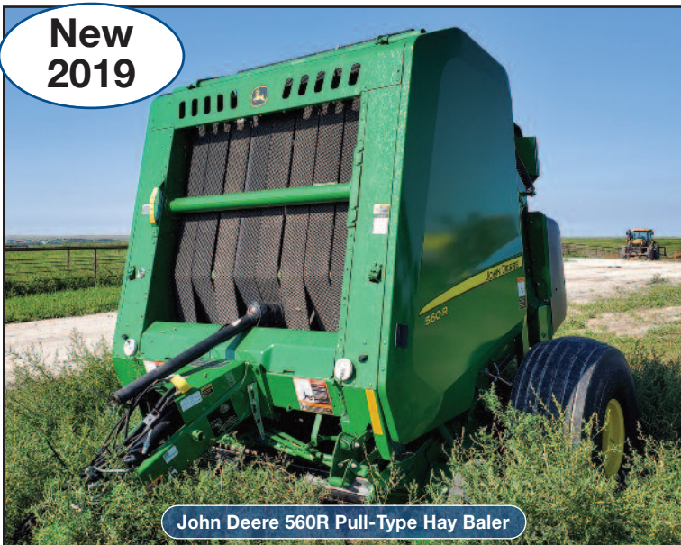
John Deere 560R Pull-Type Hay Baler