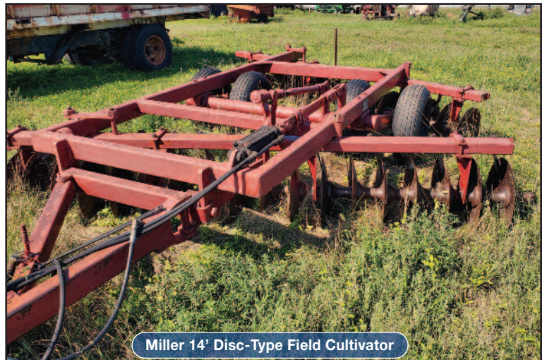
Miller 14' Disc-Type Field Cultivator