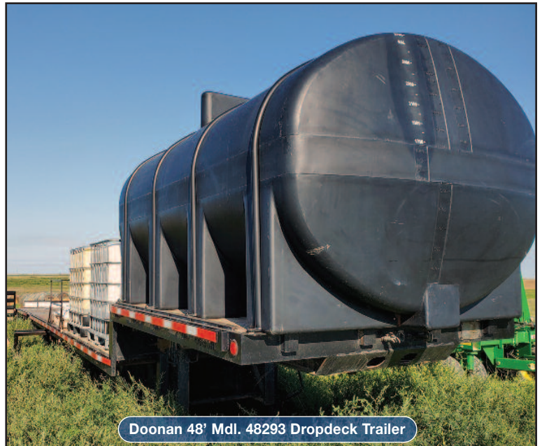
Doonan 48' Mdl. 48293 Dropdeck Trailer