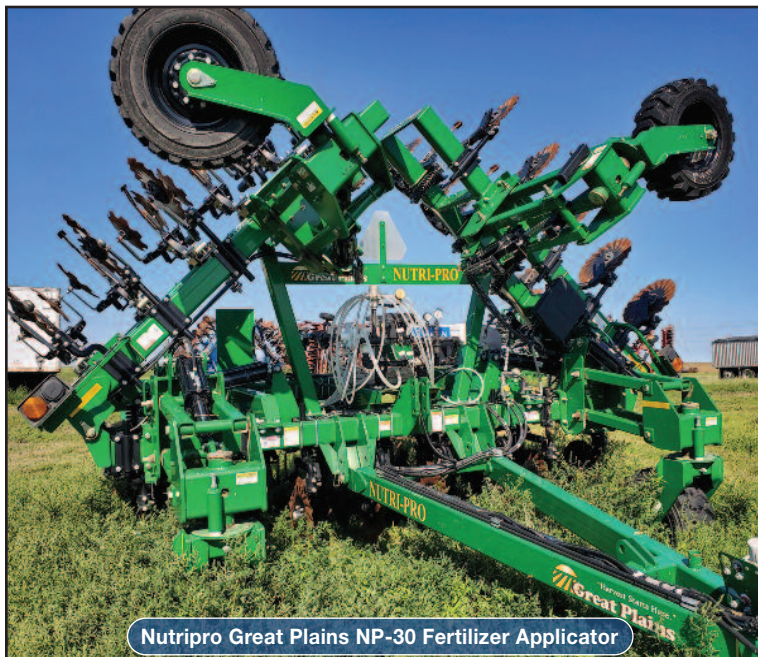
Nutripro Great Plains NP-30 Fertilizer Applicator