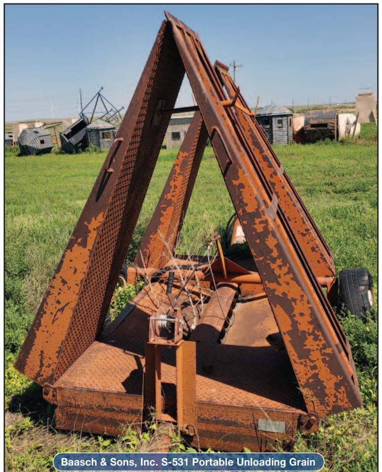
Baasch & Sons, Inc. S-531 Portable Unloading Grain