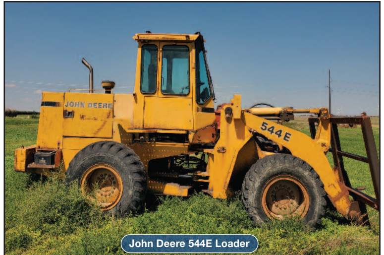
John Deere 544E Loader