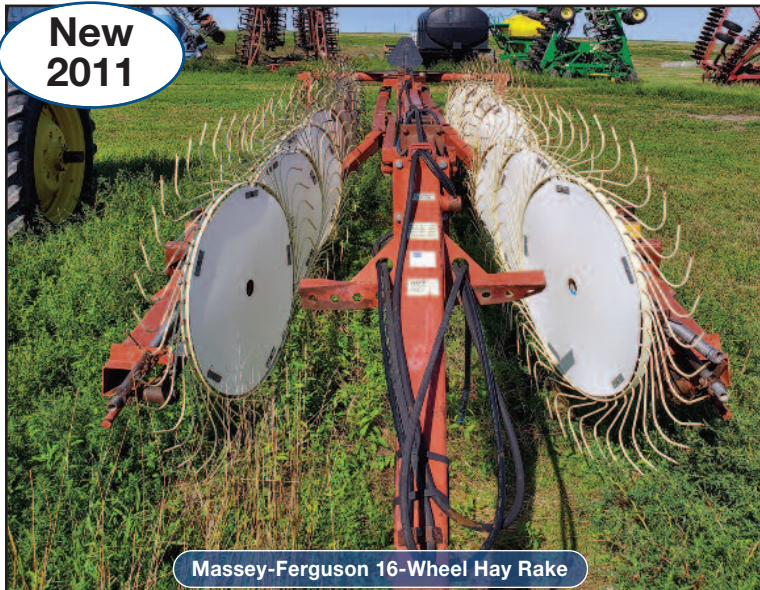
Massey-Ferguson 16-Wheel Hay Rake