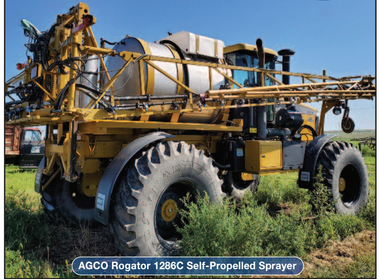
AGCO Rogator 1286C Self-Propelled Sprayer