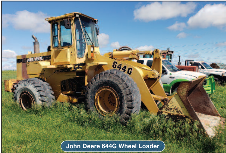
John Deere 644G Wheel Loader

1978 John Deere 762 Motor Scraper, S/N 002445T, (Transmission Out)