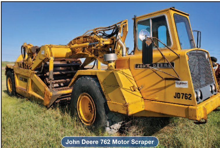
John Deere 762 Motor Scraper