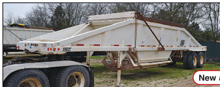
New as 2008