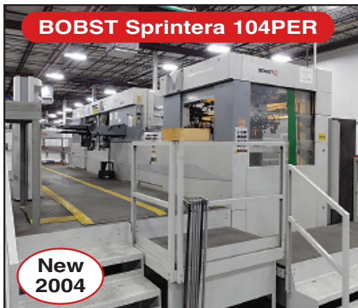
BOBST Sprintera 104PER

Die Cutting, Foil Stamping, Embossing & Folding Equip.